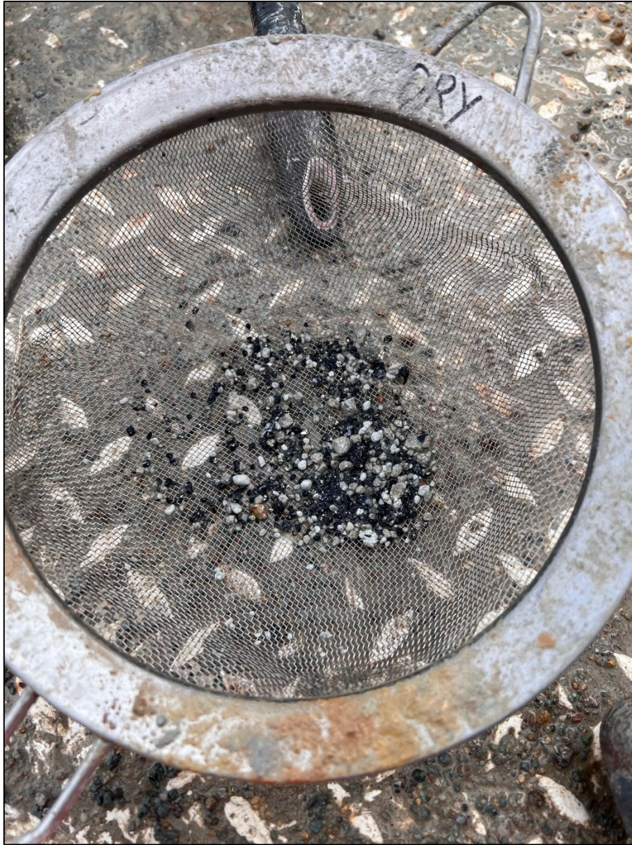
Photo 3. Sieved material from SJAC117 41-42m showing +50% covellite-coated (dark blue / black) chalcopyrite (yellow) grains. Note that the sieving washes away the clay component of the sample and that the percentage of material remaining in the sieved component is upgraded as a proportion of the total sample and therefore likely over-represents the sulphide content. Sieve is approximately 150mm in diameter.