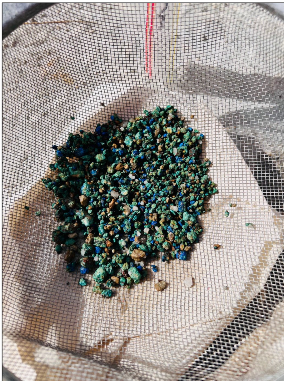
Photo 2. Close up of SJAC112 16-17m showing distinctive azurite and malachite copper oxide minerals. Note that the sieving washes away the clay component of the sample and that the percentage of material remaining in the sieved component is upgraded as a proportion of the total sample. Sieve is approximately 150mm in diameter.