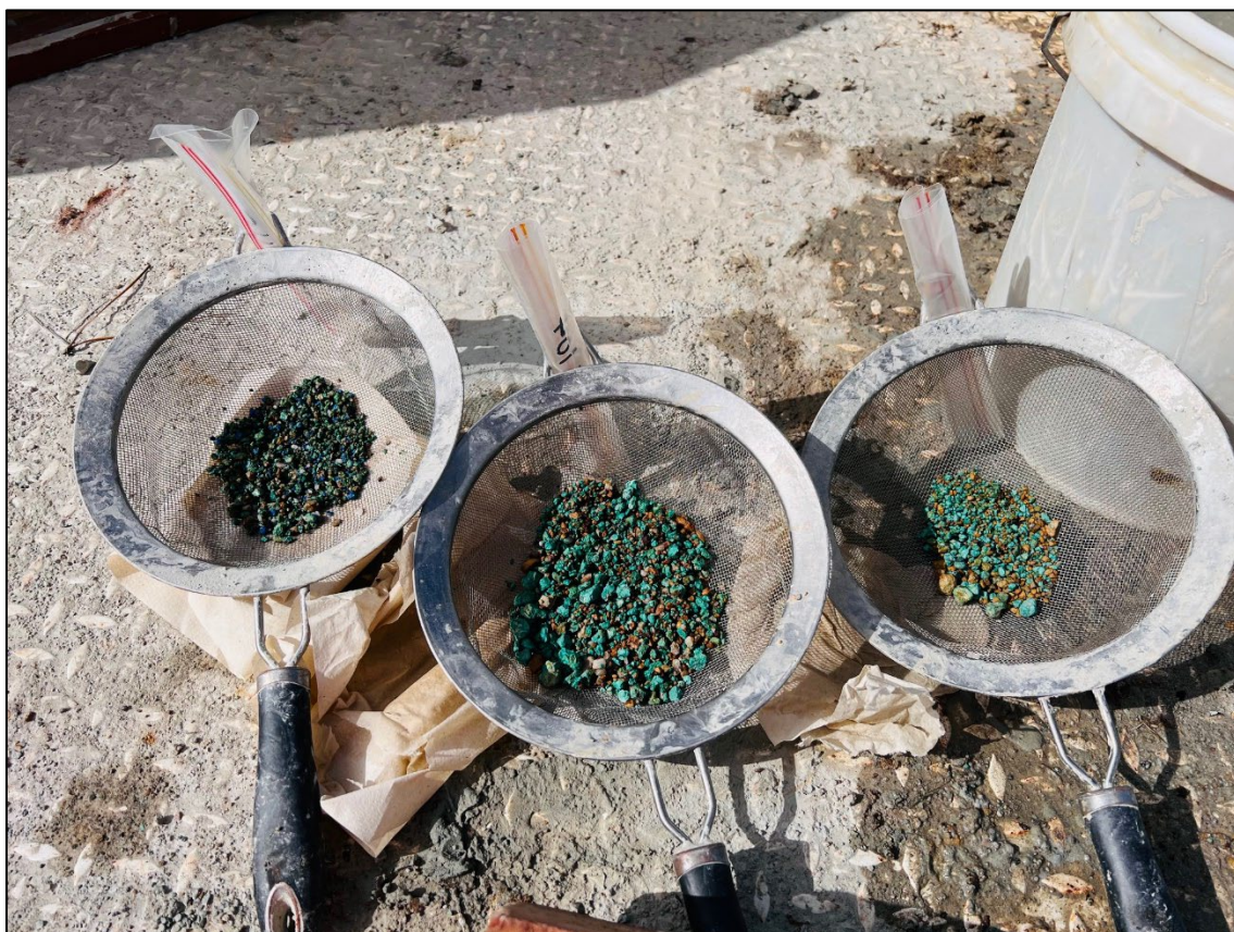
Photo 1. Sieved aircore chips from (L-R) SJAC112 16-17m with azurite (blue) and malachite (green), SJAC104 2-4m, and SJAC103 19-20m. Note that the sieving washes away the clay component of the sample and that the percentage of material remaining in the sieved component is upgraded as a proportion of the total sample. Sieves are approximately 150mm in diameter.

Drilling samples and rock-chip samples of gossanous float, especially extending to the north of the area of recent aircore drilling, have been received by the assay laboratory and results are expected near the end of September.