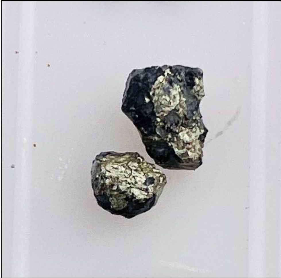
Photo 4. Close up of covellite-coated (dark blue / black) chalcopyrite (yellow) chips – the larger is approximately 5mm long.