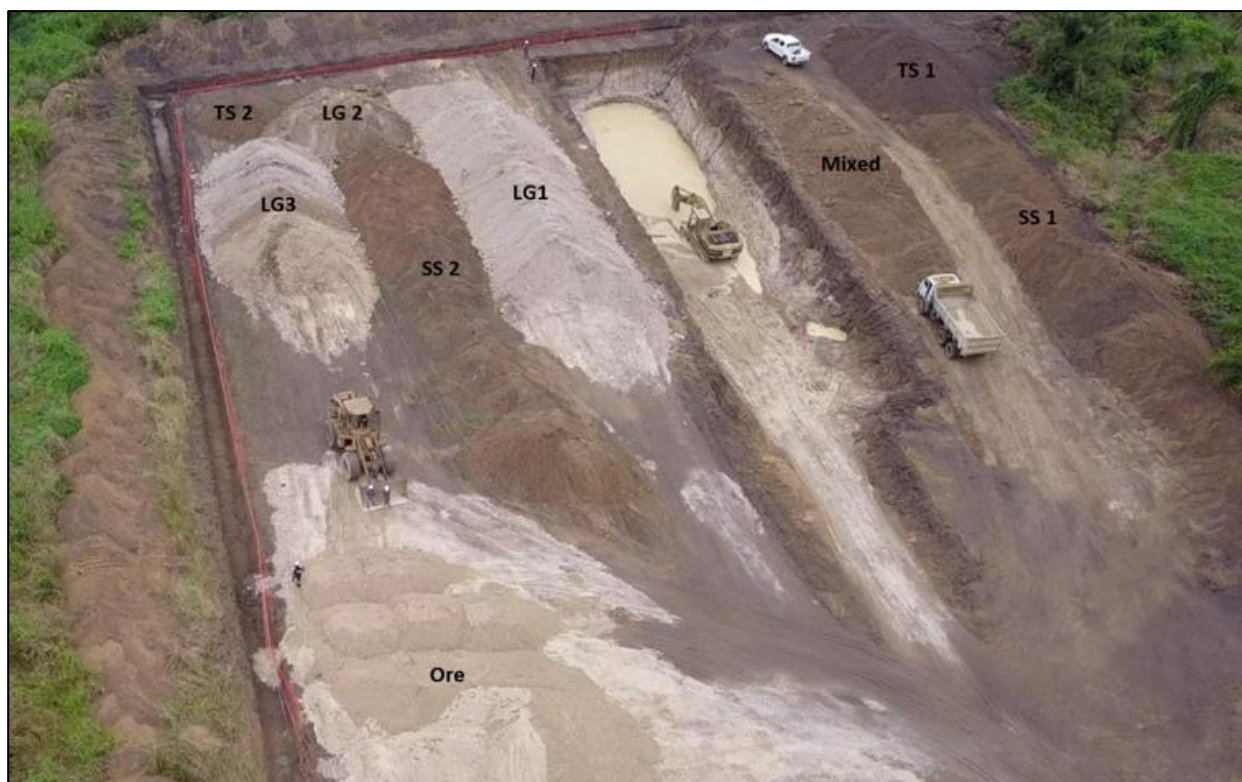
Figure 2 – Cácata mine site and pit design with works being undertaken for the 250-tonne bulk sample.