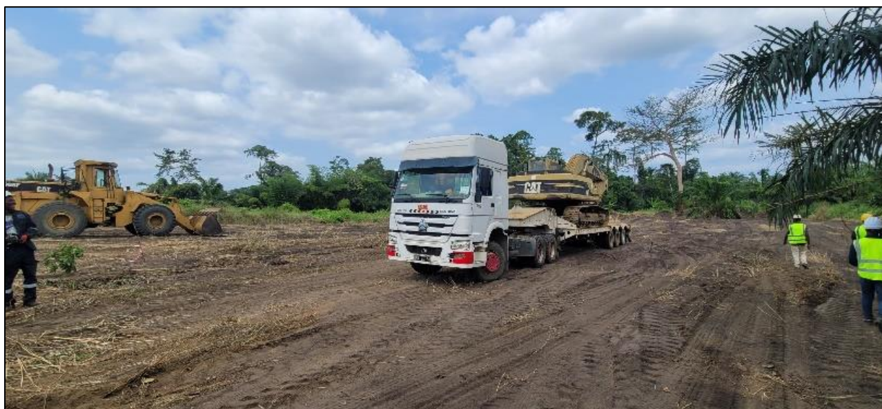
Figure 1 – Heavy earthmoving machinery being dropped off to the Cácata mine site, to commence work on the bulk sample.

Site establishment started from the mobilization of the Mining Fleet composed by one excavator and one Front End Loader (Figure 1).