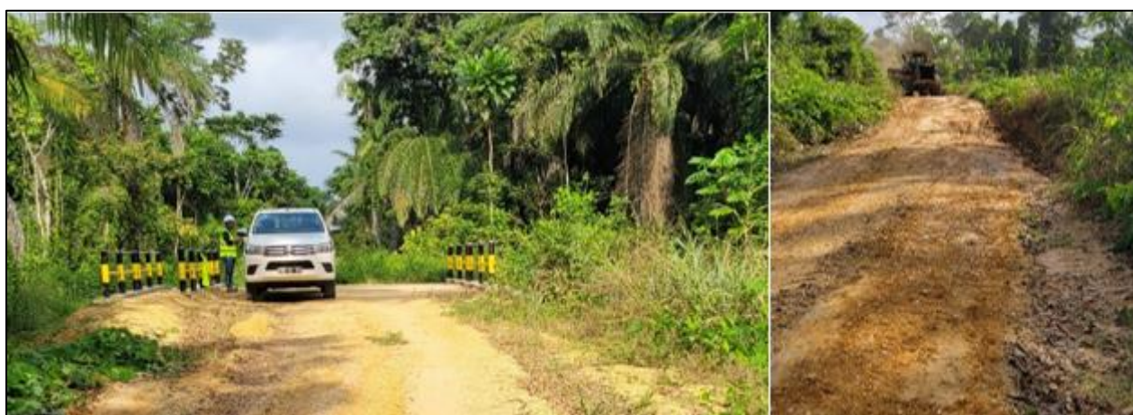
Figure 3 – Site access roads to the Cácata mine site being re-grated and upgraded.

During the reporting period, the Company also carried out extensive haul road rehabilitation activities to ensure access and transportation safety (taking into consideration the initial status of the haul road). The existing roads were repaired and upgraded to withstand the increased traffic and heavy machinery used in mining operations.