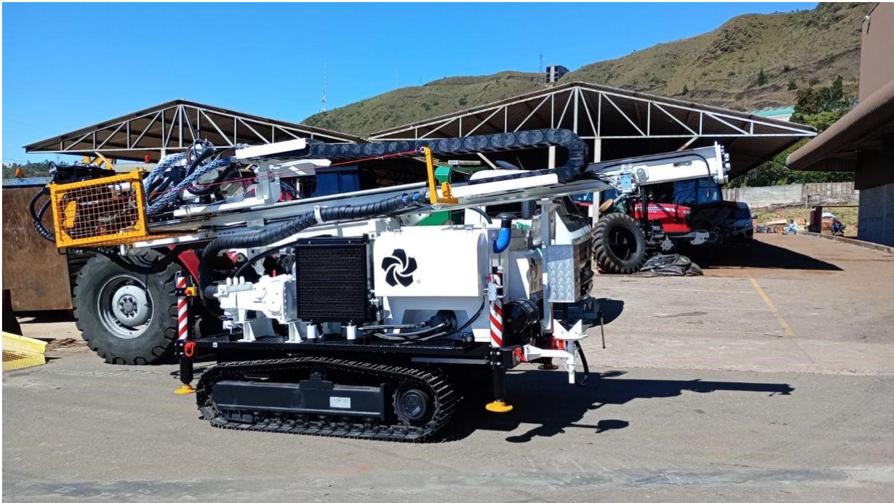
Figure 3: Third Party Boart Longyear LX11 RC Drill Rig deployed to the region

The scout auger drilling program has produced encouraging results, particularly in the detection of significant cerium anomalies across 30 intervals. These anomalies indicate active cerium mobilisation within the weathering profile, pointing to potential zones of rare earth element enrichment, which suggest the presence of ionic rare earth mineralisation. These findings are particularly promising, as several of these intervals fall within the medium to high-grade categories, making them strong candidates for further exploration.