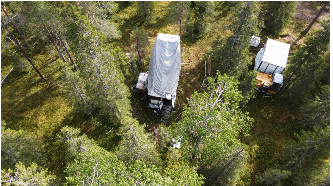
Figure 1: Drill rig at K9 Prospect

"Results from both prospects will be used to identify whether maiden JORC Mineral Resource Estimates can be calculated to grow our existing Global Resource base."