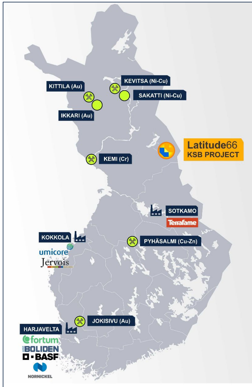
Figure 3: KSB Project location map