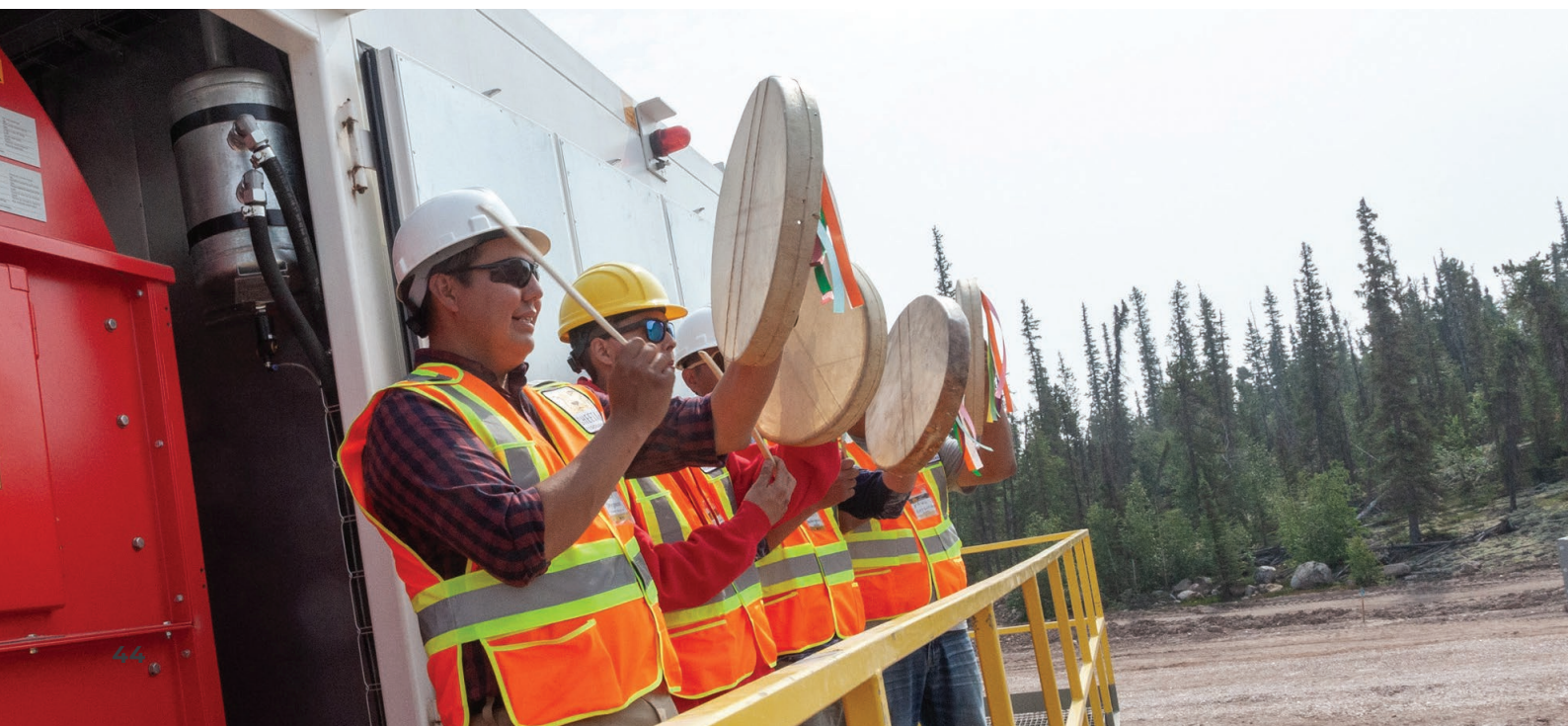
Photo Below: Yellowknives Dene First Nations drummers commissioned the TOMRA sorter in July 2021 with drum songs and prayers.