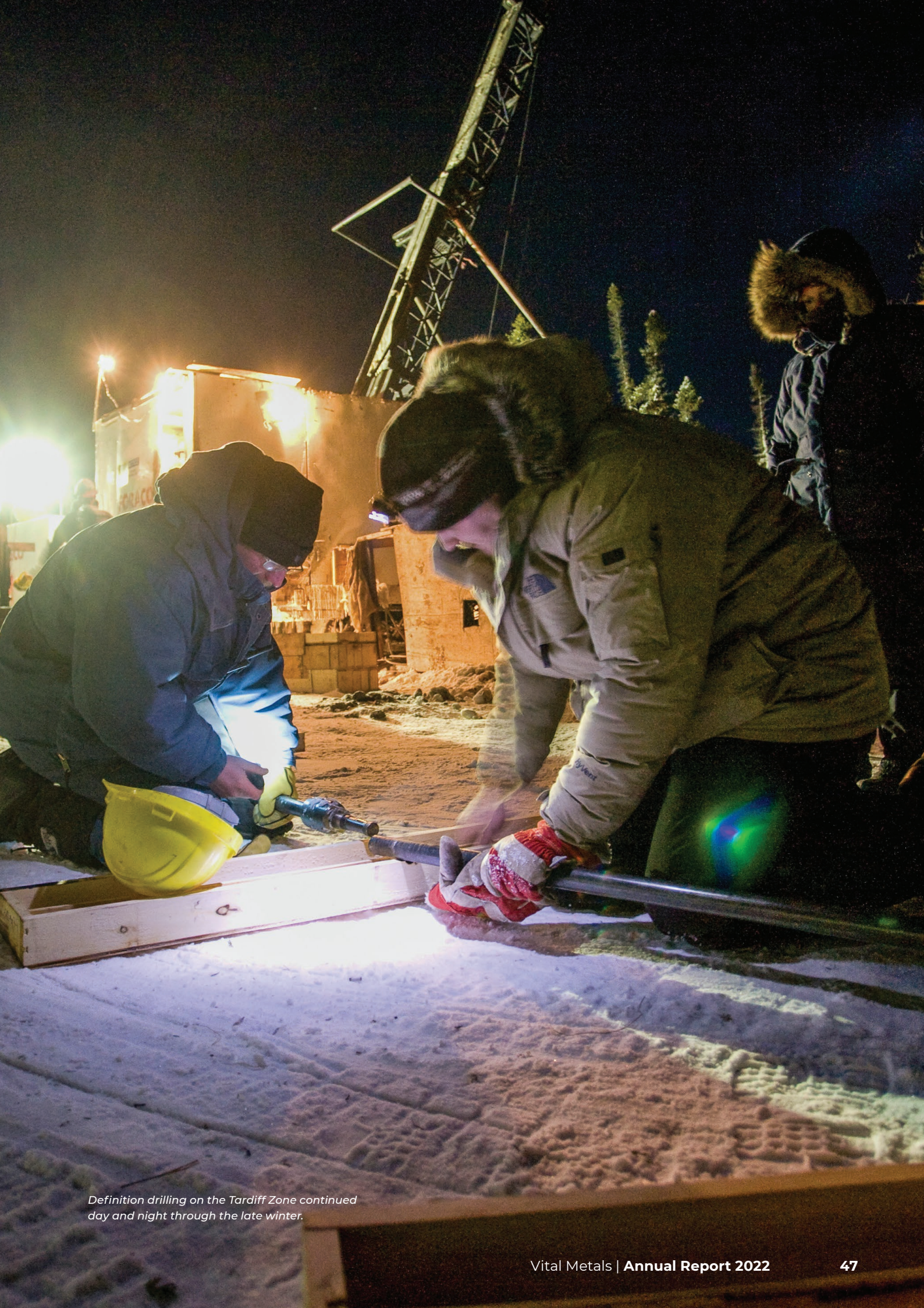
Definition drilling on the Tardiff Zone continued day and night through the late winter.