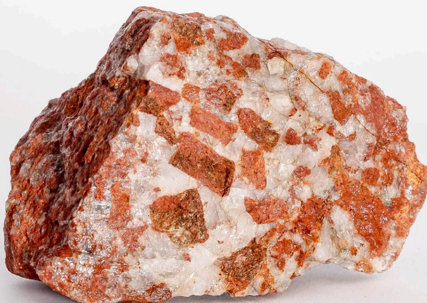
Photo Below: This fist-size sample of bastnaesite rare earth ore is hosted in white quartz country rock at the Nechalacho Mine's North T zone. It contains some of the world's highest grades of rare earth elements.

Other than as disclosed in this Annual Report, no significant changes in the state of affairs of the Group occurred during the financial year.