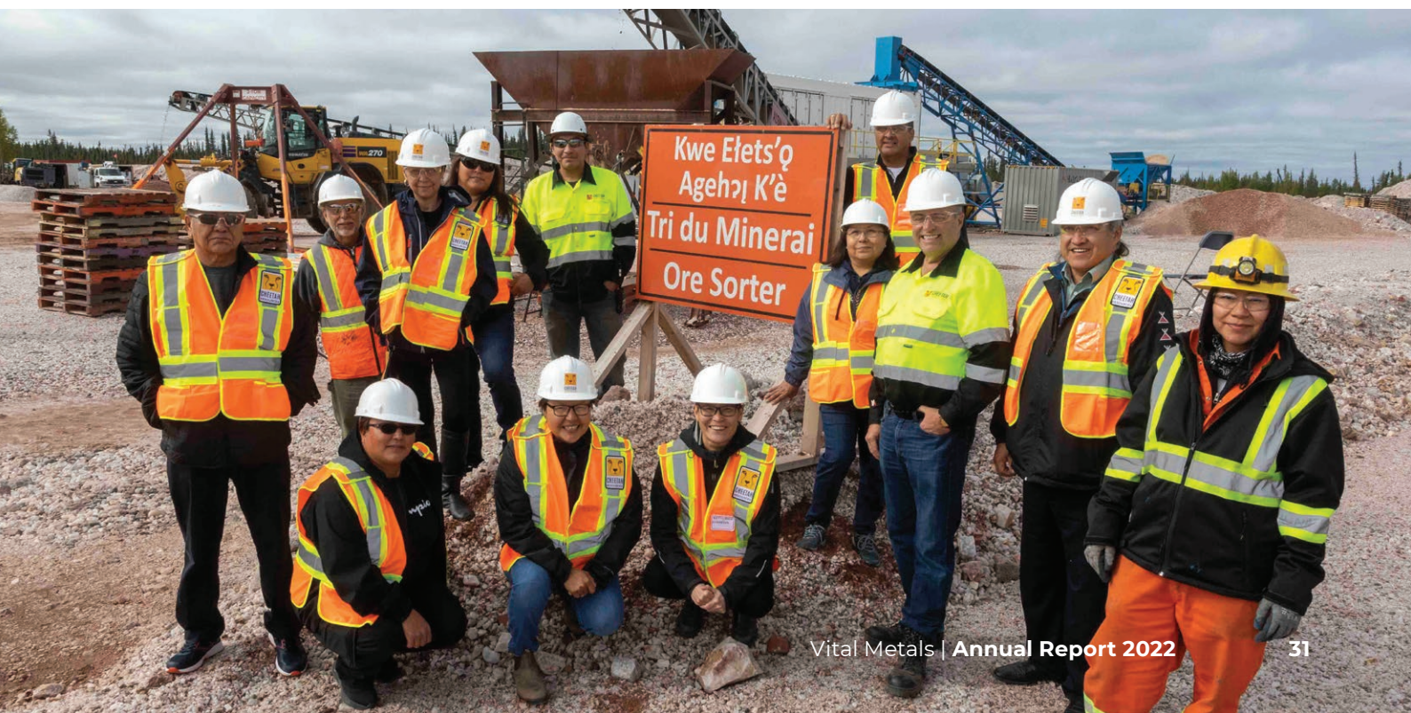
Photo Below: Community tours bring leaders and elders into Nechalacho to see the operation and become familiar with how it operates. Here, Tlicho First Nations pause for a photo near a tri-lingual sign.