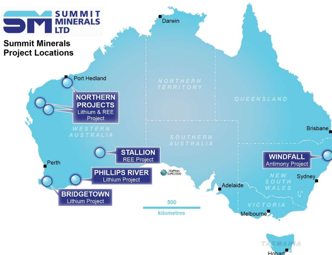
Figure 3: Summit Minerals' project locations

Authorised for release by the Board of Summit Minerals Limited.