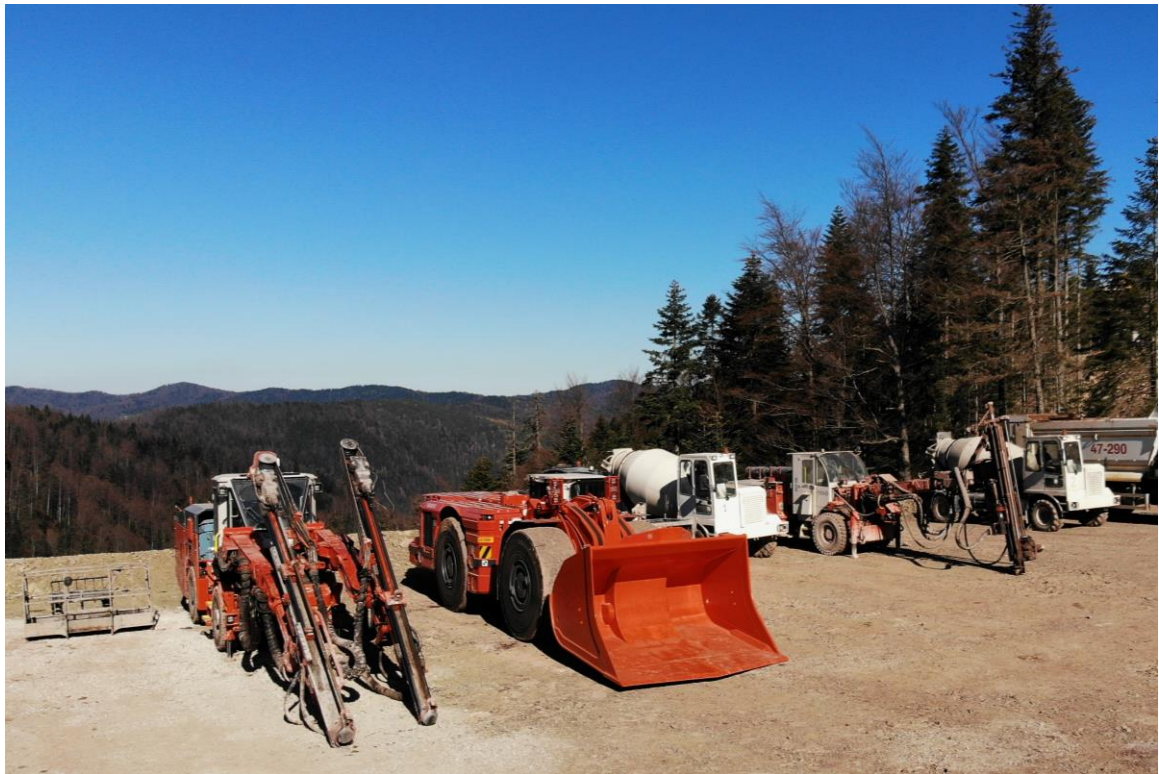
Figure 3: MMC Vehicle Park

gasified emulsion explosives. Non-gasified emulsion does not require storage in a dedicated magazine and therefore removes the requirement to develop a costly underground facility. The existing surface, temporary, magazine in this cost saving scenario can be utilised to store detonators. Non-gasified emulsion also provides better blasting efficiency and reduces blasting gases with the potential to proportionally decrease blasting cycle times.