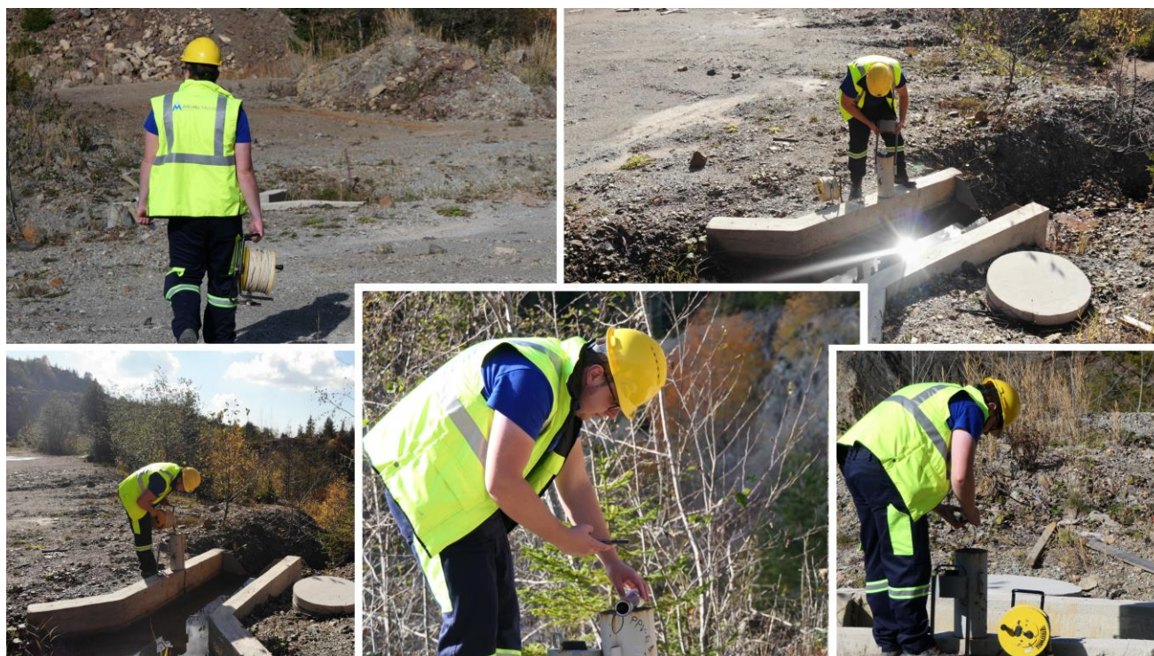
Figure 10: Water testing

The Adriatic Foundation continues to provide free English courses for all applicants from the Vares community. In addition, 30 scholarships for high school and university students have been provided.