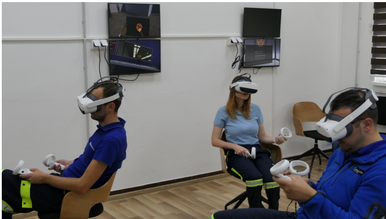
Figure 7: Virtual Reality H&S Training, Vares

The Adriatic team has commenced a safety training program using a purpose-built Virtual Reality training centre offering 13 different simulation modules. The Company has also commenced the development of a safety database to enable electronic workflows through smart tablets and phones, empowering both staff and contractors to report safety matters more efficiently and effectively.