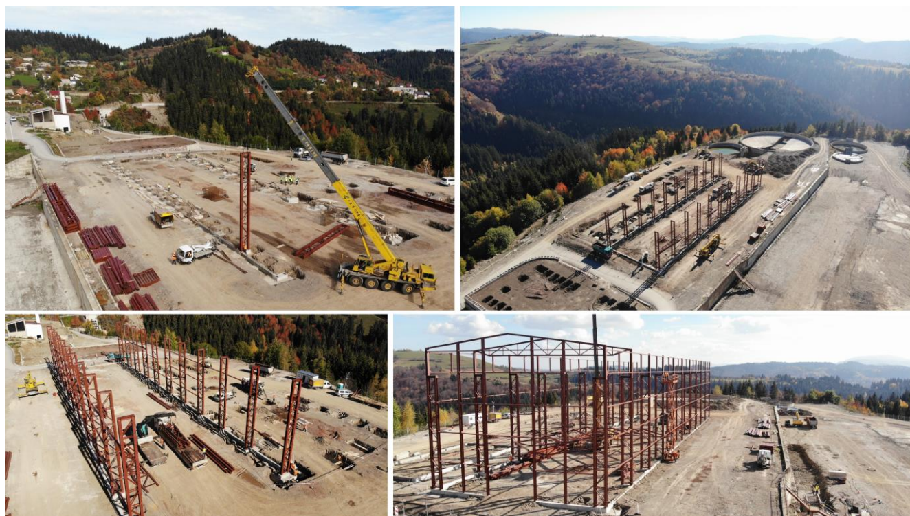
Figure 4: Vares Processing Plant Progress