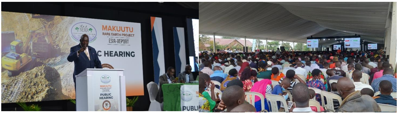
Figure 3: Stakeholder engagement was very strong, with strong support from Hon. Peter Lokeris, Minister of State for Mineral Development (left) and local residents turning up in significant numbers (right).

Subsequent to the end of the quarter, the approval of the ESIA was received on 26 October 2022, with the Approval Certificate awarded at a ceremony organised by the Ugandan Government and NEMA, in recognition of the flagship nature of the Project and its significance to the country's development outlook as enshrined in Uganda's National Development Plan NDP-III (ASX: 27 October 2022).