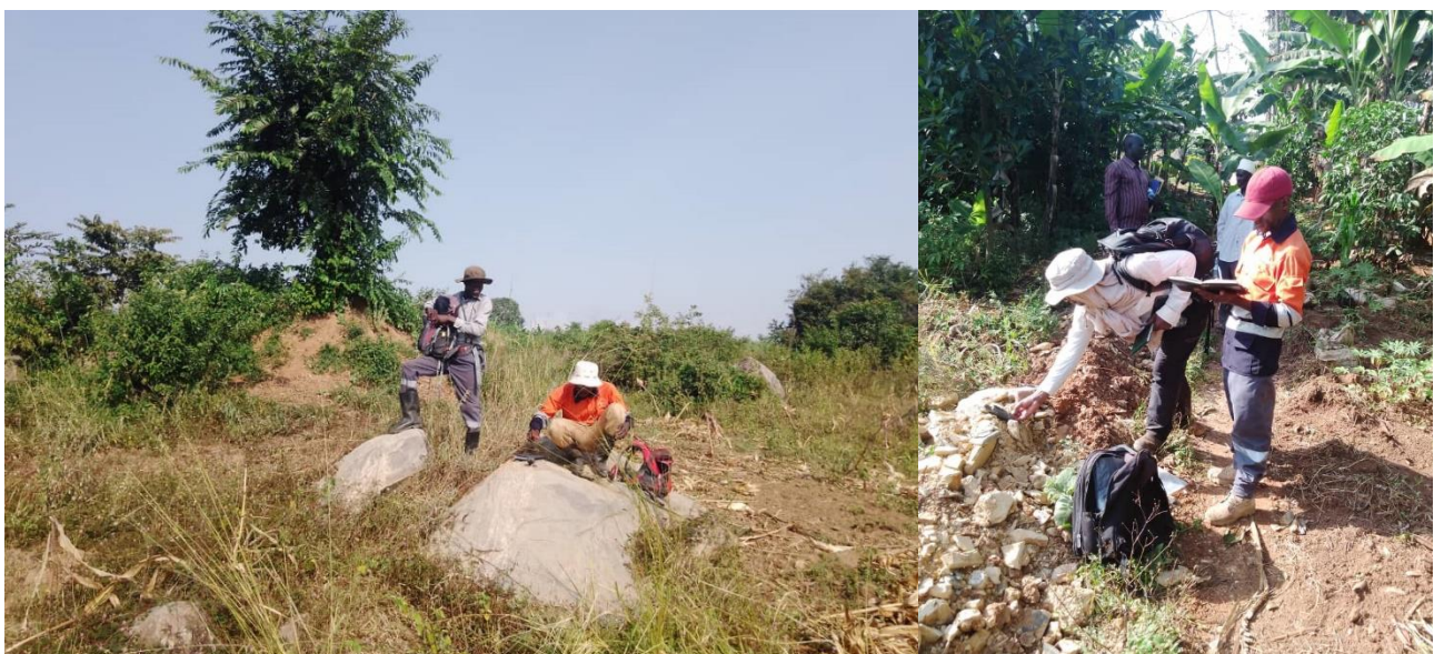
Figure 4: Field mapping activity completed at exploration targets identified on EL00147 and EL00257.

During the quarter, RRM completed geological mapping of two of its exploration licenses, EL00147 in Kapyanga sub-county of the Bugiri district, and EL00257 in both Bulamagi and Nakigo sub-counties of the Iganga district. The overall objective of the activity was to establish areas which have potential to contain clays with ionic adsorbed REE. Once identified, such areas could be the focus of future exploration programs.