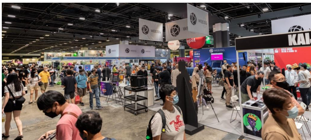
Figure 1. Overview of MetaVI x Web3SG Booth in COMEX 2022