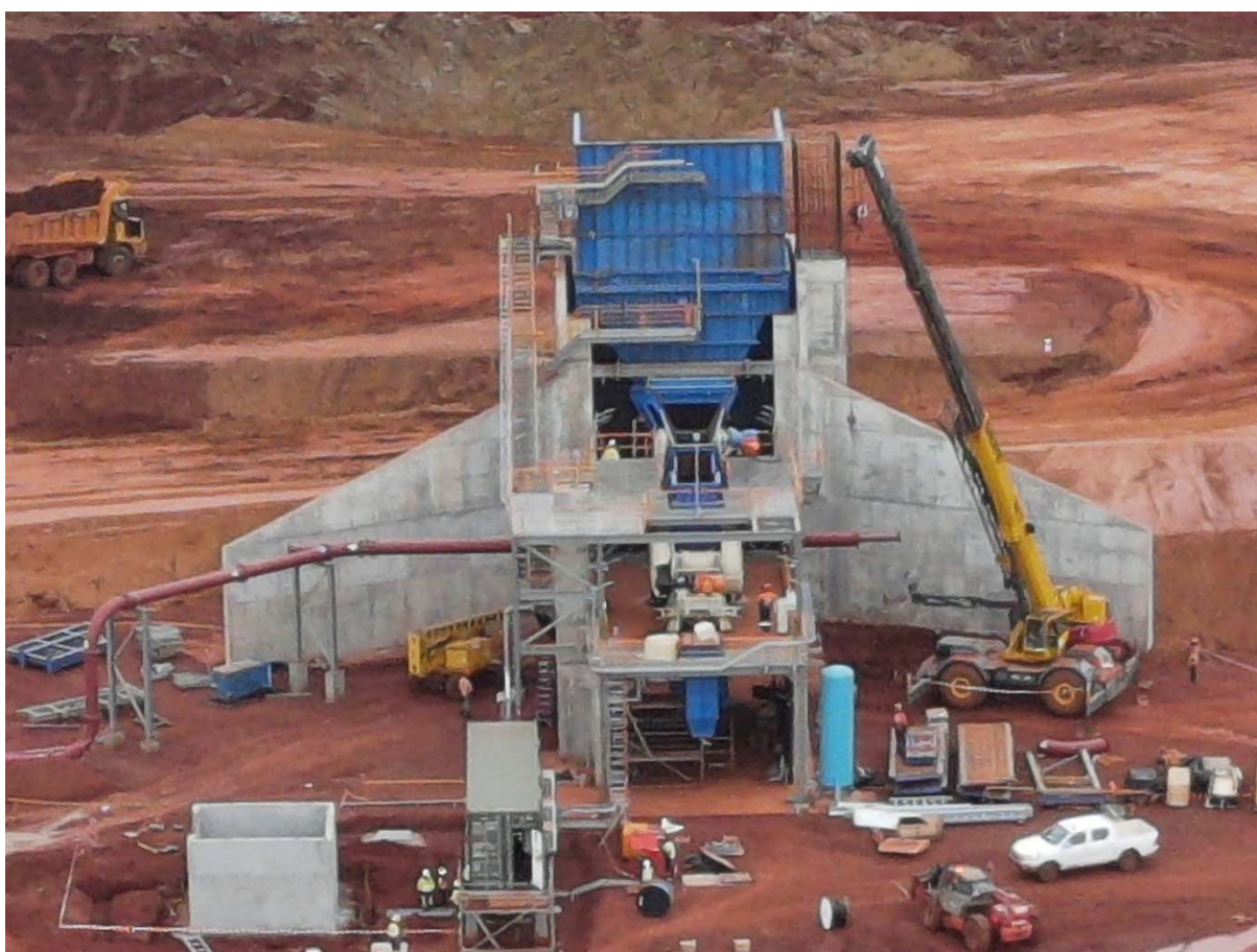
Figure 5: Crushing Chamber and Rom Bin