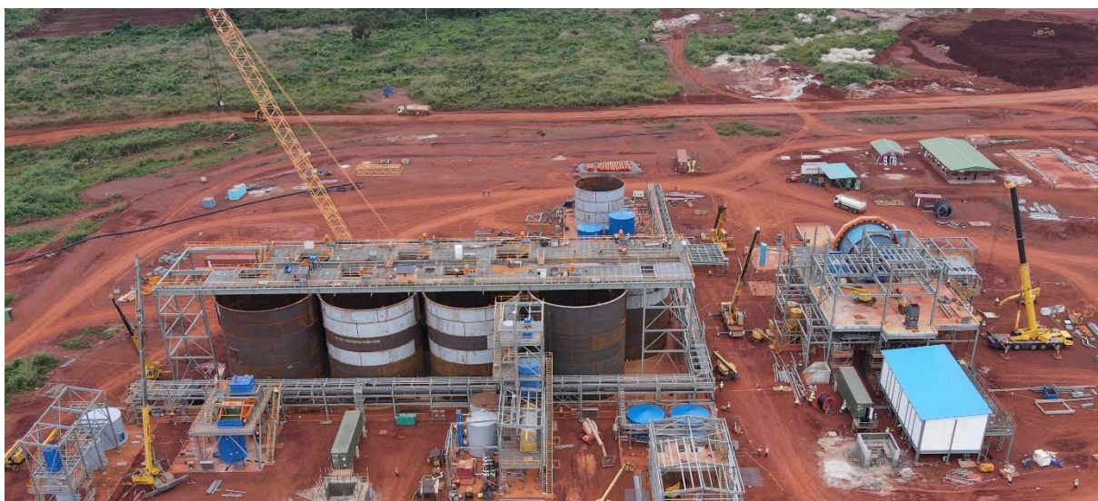
Figure 3: CIL tanks with Agitators installed, Reagent mixing, tails pumping, elution, carbon regen and gold room.