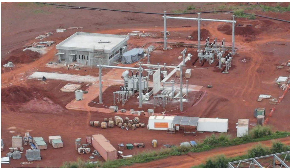
Figure 8: Abujar 90 KV substation