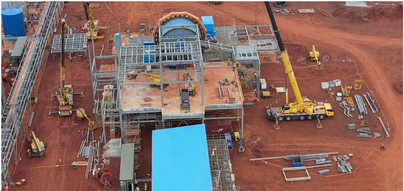
Figure 2: Classification Steel structure erection

Construction continues to track well against schedule. Mill gear alignment and lubrication piping is complete and the mill lining is scheduled for October. Structural steel installation is 70% complete and concrete on the process plant is practically complete. All motor control centres (MCCs) arrived on site. Transmission lines and substation progressing well and work continues on site buildings, tailings storage facility (TSF) and diversion channel. The following figures show the progress achieved on site during September 2022.