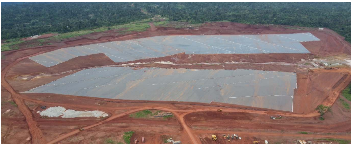
Figure 7: TSF - HDPE lining