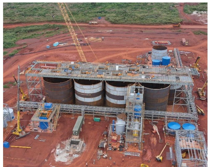
Figure 1: Overview showing construction status of the classification steel structure and CIL tanks on 7 October 2022