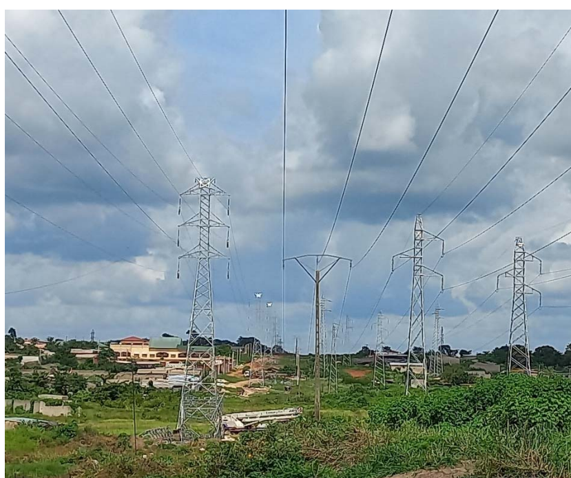
Figure 9: 90kv transmission line (Daloa)