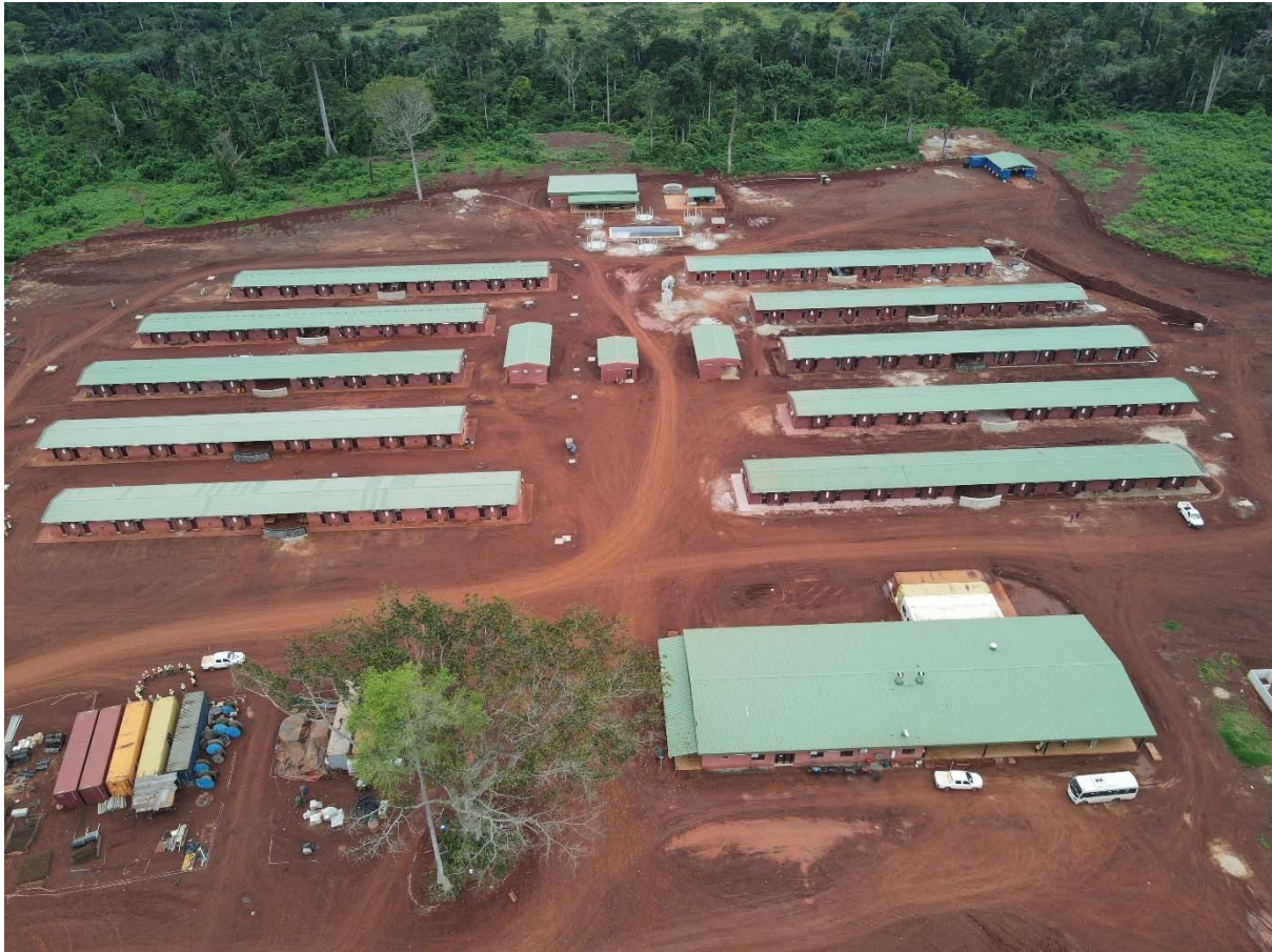
Figure 6: Overview of accommodation rooms and cafeteria