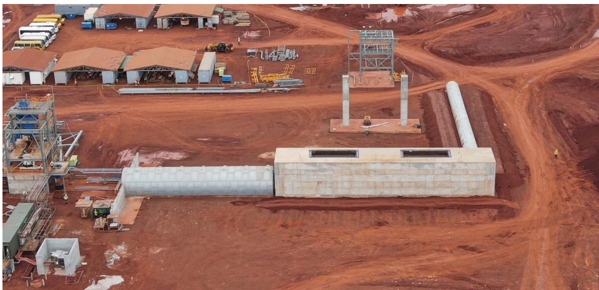
Figure 4: Overview of reclaim chamber and pebble crusher