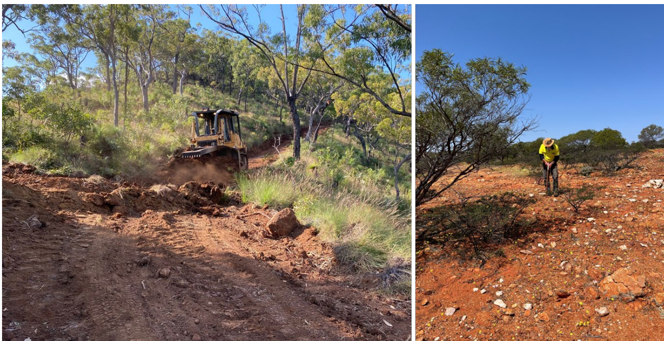
LEFT: EARTHWORKS AT MT SLOPEAWAY PROJECT, QLD OCTOBER 2022. RIGHT: PEGGING PROPOSED DRILL LOCATIONS AT YALGOO PROJECT, SEPTEMBER 2022

"The completion of these maiden drilling campaigns at our battery metals projects in WA and QLD have the potential to be transformational for the Company."