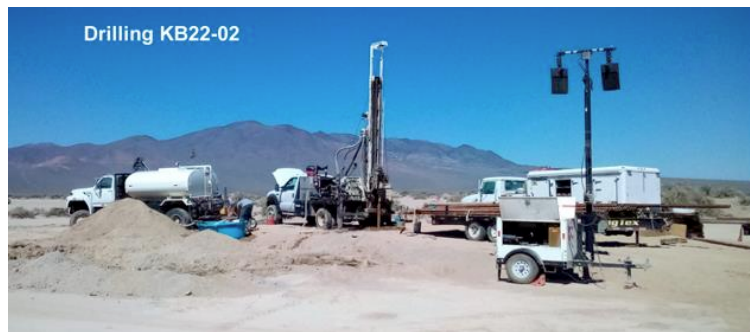
Figure 3 – Drilling at KB22-02