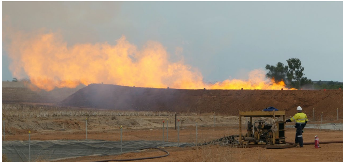
Figure 2: Lockyer Deep-1 production test operations

The production test confirmed high quality gas with 87.5% methane, 3.9% CO 2 and low H 2 S. Associated condensate was produced throughout the test, with an estimated CGR (Condensate-Gas Ratio) of 3.2 barrels per MMscf gas offering significant value upside. Subsequent analysis of test data confirms that the testing objectives were met, with a high-quality dataset recorded. Key insights from this analysis include an estimated Absolute Open Flow rate for Lockyer Deep-1 (i.e., unconstrained by tubing) of 190 MMscf/d, and an estimated 70 Bcf to 110 Bcf gas-in-place connected to the Lockyer Deep-1 well within the well test maximum radius-of-investigation (representing an area of approximately 3km 2 ).