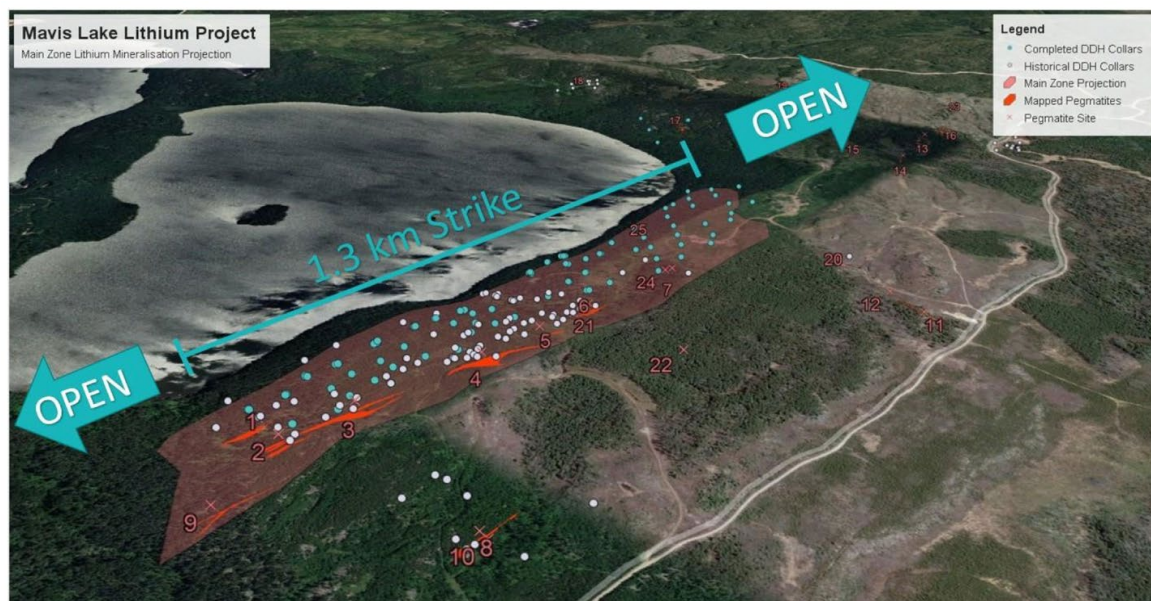
Figure 1 – Strike length of Main Zone lithium mineralization increased to 1,300m during Q4-CY22

Assays received during the Quarter verified an extension to the known strike length of confirmed lithium mineralisation by an additional 550 meters (Figure 1). The results included multiple high-grade intercepts, as well as sections of extremely high-grade mineralisation of +3% Li 2 O. The Main Zone's total strike length currently sits at 1,300 meters and remains open laterally and at depth.