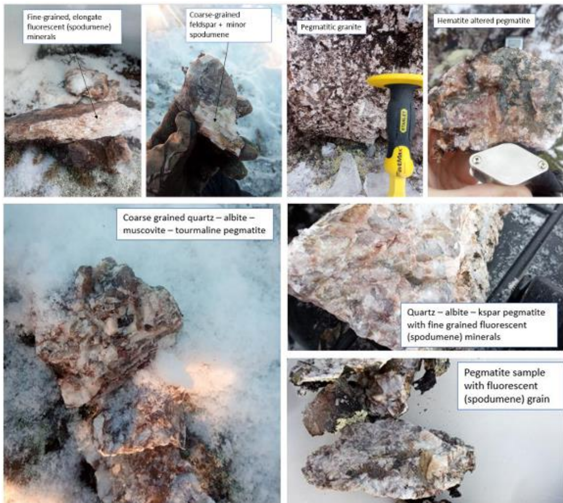
Figure 1: Various rock chip photos of pegmatite samples taken during the field work program.

Due to the extensive snow cover over the Project, the field team covered less than 5% of the 270km 2 project area and focused their efforts on windswept, outcropping areas to sample rock types prospective for lithium, as well as gold and base metals.