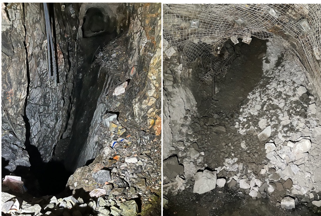
095 level stope void from above Stope ore reporting to 105E level

Following completion of the delayed secondary egress rise at the OK mine during February, Pantoro has moved quickly to commence stoping activities. The first stope excavated with down holes from the Star of Erin 095 level, has been successful in maintaining design width and excellent fragmentation.