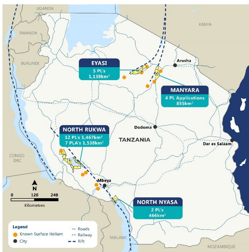
Figure 2 – Noble Helium Project Locations

The Company's flagship project, North Rukwa, already has an independently certified, summed unrisked mean Prospective Helium Resource of 176 billion cubic feet (equivalent to approximately 30 years' supply), with the benefit of legacy oil and gas exploration data. Rukwa Basin has the potential to be the world's third largest helium reserve behind USA and Qatar.