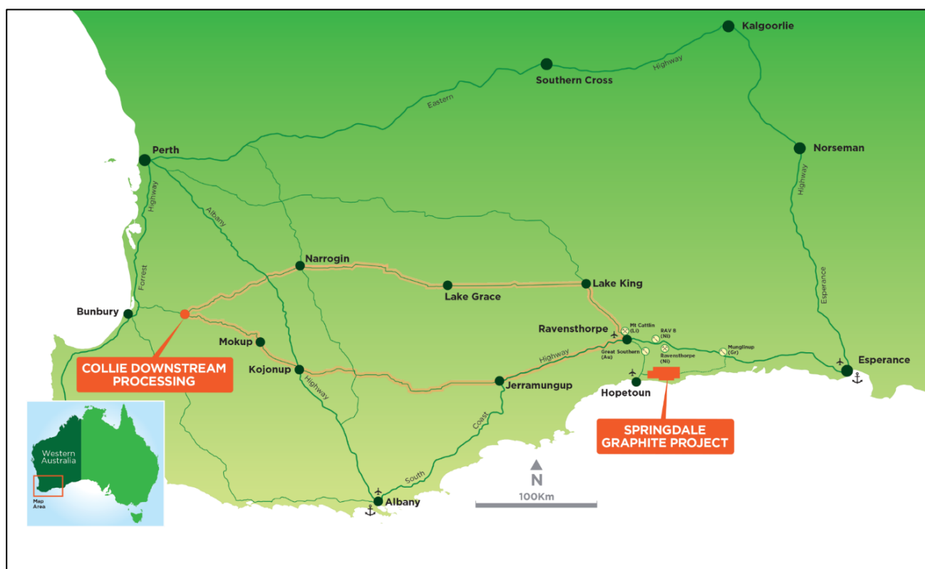
Figure 2: Location of International Graphite Projects.

This is the first testwork and result from drilling completed at new exploration target SDE_1. Assay results from SDE_1 are expected to be completed over the coming weeks.