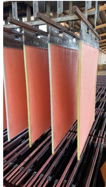
Figure 1 and 2. Austral Copper Bundles ready for dispatch. Figure 3. Cathodes in-situ at processing plant.