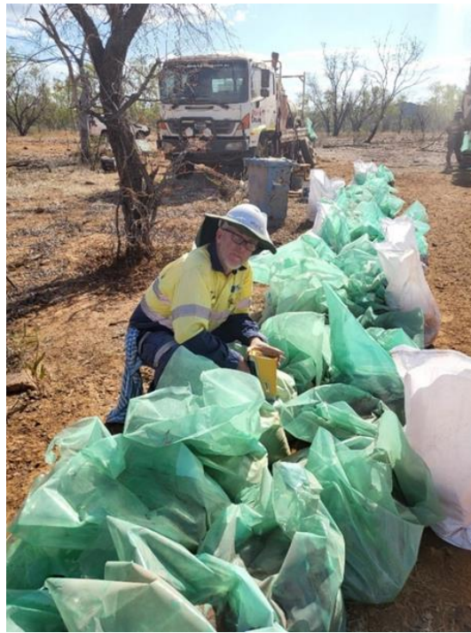
Figure 2: portable pXRF measurements on sample bags containing RC drill chips