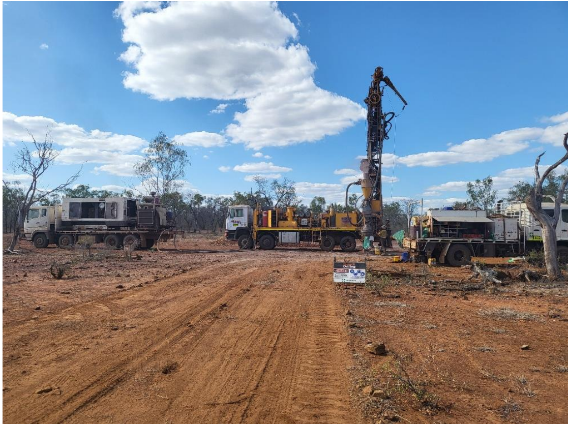
Figure 1: RC drill rig at the Calvert South Prospect, Redbank Project, Northern Territory

Visual copper and zinc mineralization was identified within the rock chip samples during the drilling campaign and field work activities.