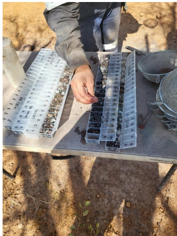
Figure 3: chip tray samples for assays Calvert South