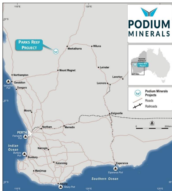
Figure 2. Location of the Parks Reef PGM Project 80km West of Meekatharra in Western Australia.

A successful and highly motivated technical and development team is accelerating Podium's strategy to prove and develop a high-value, long-life Australian PGM asset.