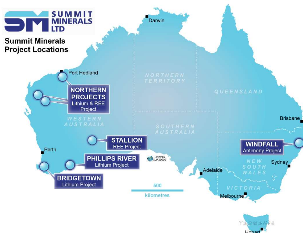
Figure 3: Summit Minerals' project locations

Approved by the board of Summit Minerals Limited.