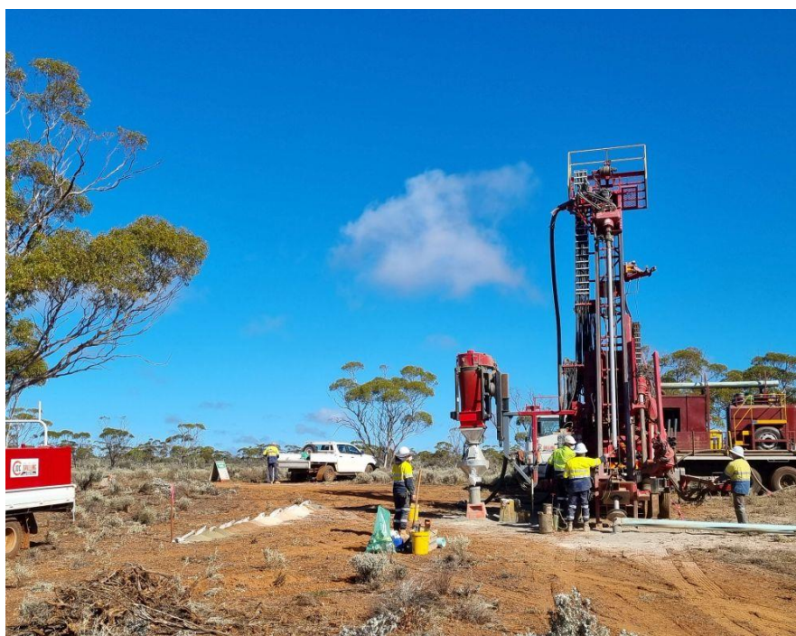
Figure 1: Drilling commences at Midas' Newington lithium-gold project in WA

Midas’ previous rock chip and auger geochemistry identified lithium and tantalum-bearing LCT pegmatites at surface (refer Midas ASX announcements; 8 August 2022, 28 July 2022 and 2 May 2022).