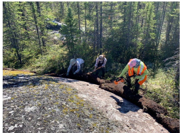
Figures 3 & 4 - Field team members examining new pegmatite outcrop at Adina