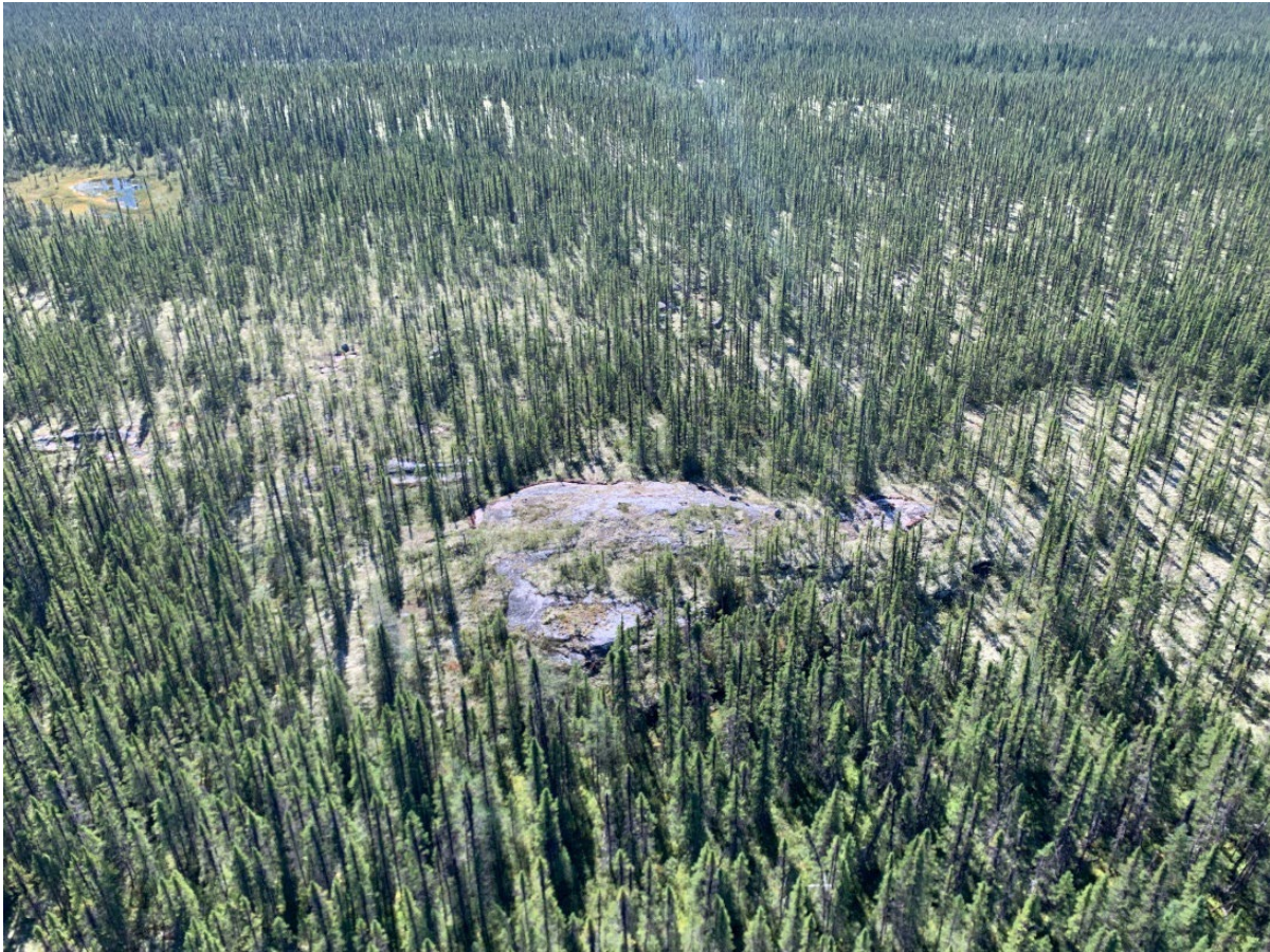
Figure 2 – New pegmatite outcrop viewed from the air