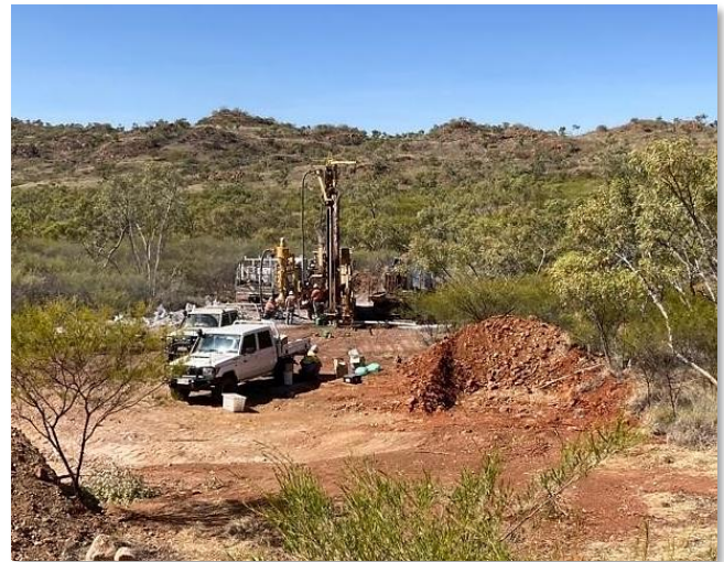
Plate 1: RC Drilling at King Solomon Prospect August 2022

The Cooper Board has made the key decision to expand the original drill program by around 50% to continue to follow the host shear zone further along strike and down dip. The Company expects the current program to finish in early September, with the remainder of the drill samples to be priority processed through the laboratory.