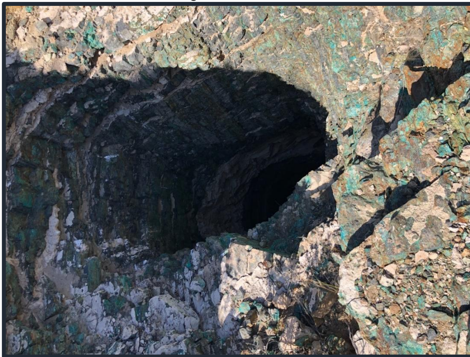
Figure 6: Example 1 of historical workings on the copper rich zones (oxides; chrysocolla, malachite and subordinate azurite whereas sulphides are chalcopyrite, bornite and chalcocite) hosted within the calc-silicates