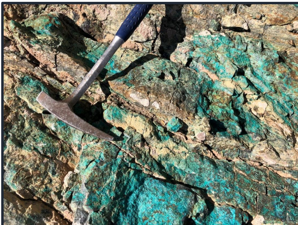
Figure 4: Outcropping copper mineralisation (malachite, chrysocolla and relicts of chalcopyrite) hosted by a silicified calc-silicate unit.