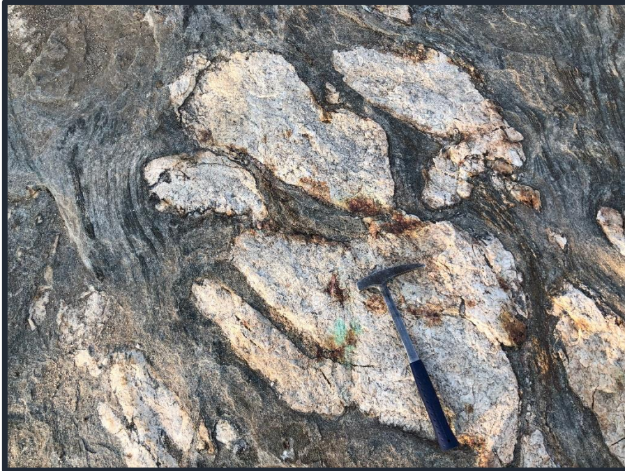
Figure 1: Endo-skarn granitic boudin Cu mineralisation with partly oxidized pyrrhotite within the highly deformed Marble-calc silicate