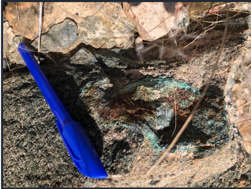
Figure 3: Skarn altered (tremolite-actinolite, diopside and epidote) mineralised marble