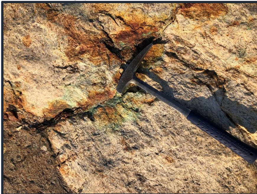
Figure 2: A mineralised ferruginous Quartz vein containing gold, copper and pyrite crosscutting a calc-silicate and granitic dike