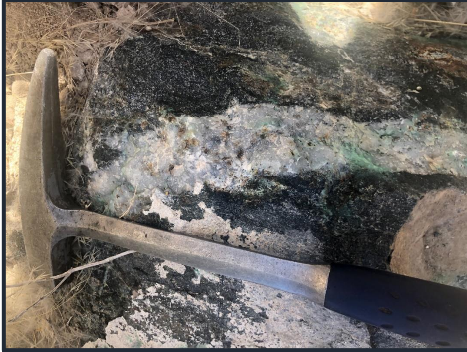
Figure 5: Pyrrhotite and minor malachite stained quartz vein, part of the sheeted quartz veins being targeted in the schists