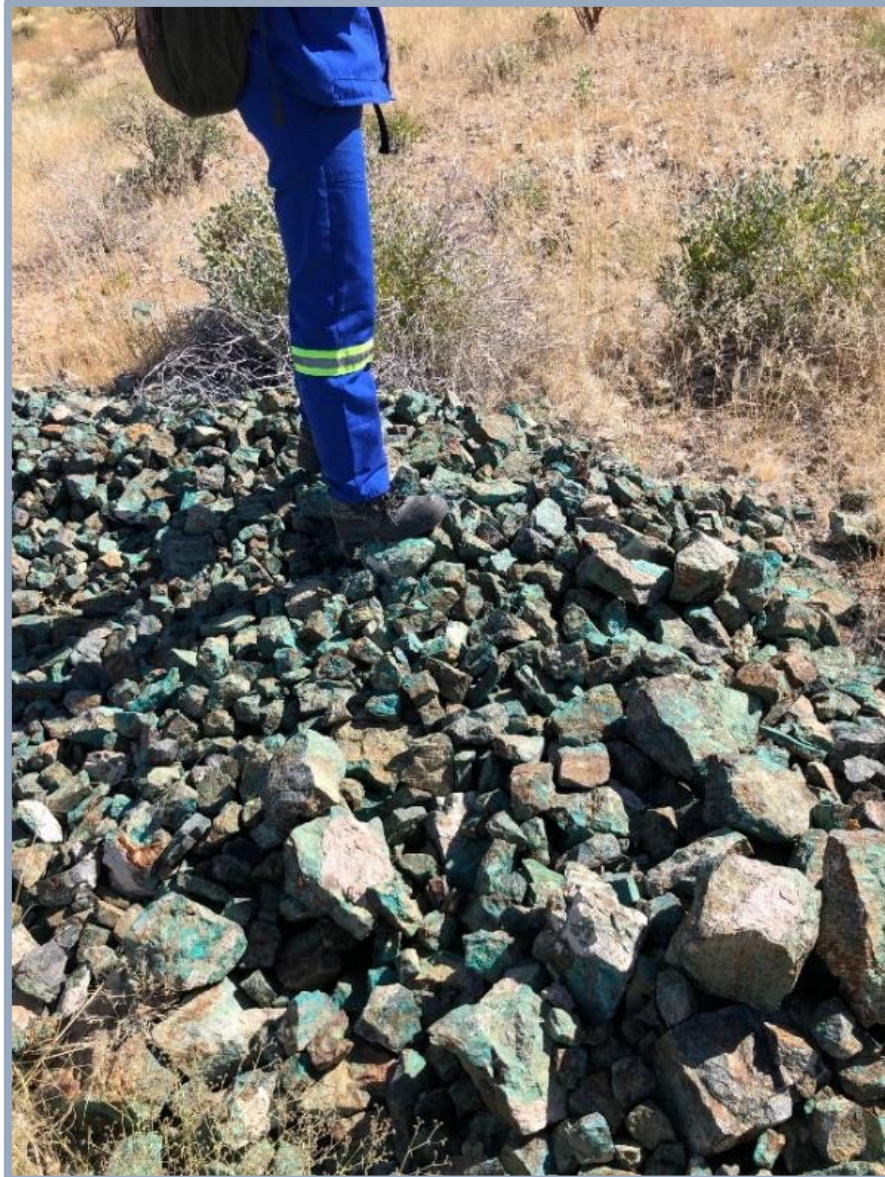
Figure 7: Example 2 of historical workings on the copper rich zones (oxides; chrysocolla, malachite and subordinate azurite whereas sulphides are chalcopyrite, bornite and chalcocite) hosted within the calc-silicates