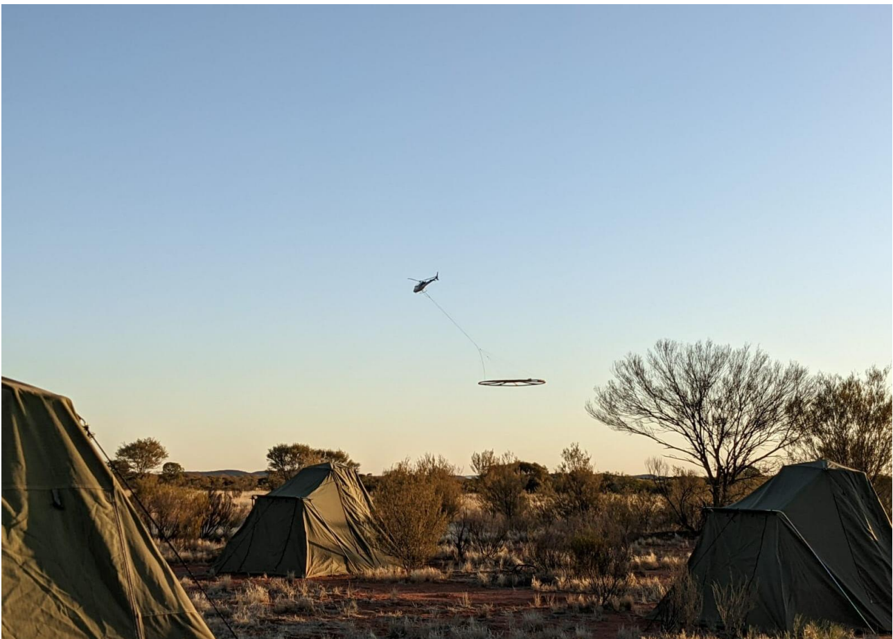
Figure 3. Early morning, Mount Squires Project Camp, August 2022.

"We're looking forward to a busy couple of months at Mount Squires, with the results of drilling at the Duchess Prospect and the remainder of initial soil geochemistry still to come, followed by the results of the AEM survey. And then later in September we'll start the second phase of aircore drilling to complete the first-pass testing of the Duchess Prospect and potentially drill some new nickel-copper targets on the West Musgrave magmatic corridor. All results will be returned by the end of the year, by which time we'll be back drilling at our Yarawindah Brook Project. It will be an exciting end to the year for our shareholders!"