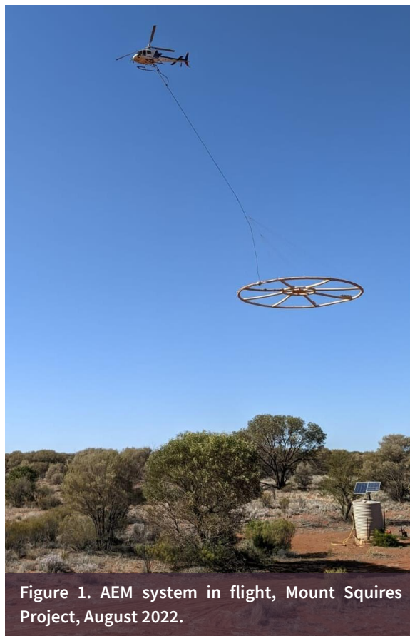
Figure 1. AEM system in flight, Mount Squires Project, August 2022.

The AEM survey will cover a new coincident mafic indicator anomaly comprising coincident nickel, copper, cobalt and chrome identified from recent geochemical sampling. Assay results for 1,575 Ultrafine soil samples (approximately 60% of the entire program) have been received, with initial statistical analysis of the 95 th percentile identifying two distinct coherent anomalies within a broader zone of the 90 th and 80 th percentile of results. The two distinct anomalies have peak values of 119 ppm nickel and 201 ppm copper.