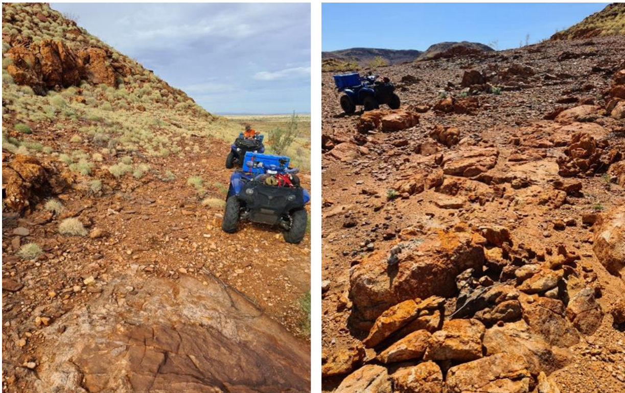
Figure 5. Thick south dipping pegmatite bodies located within the tenement package.

Adjacent tenure to the east has been drilled into by the Wodgina tenement holders and targets the tantalite and lepidolite bearing dyke swarms that trend into the Yule River Project. The highest anomalism for areas sampled was the area previously identified by Metalicity at Stannum.