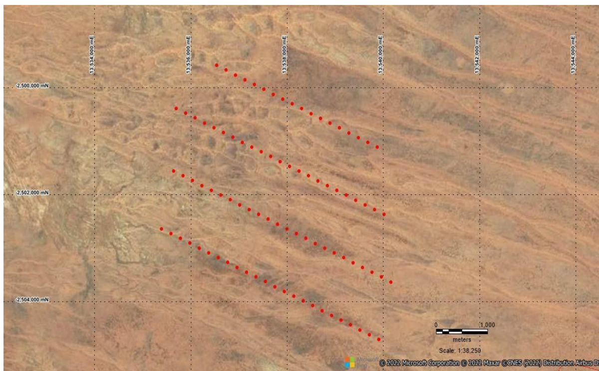
Figure 2. MLTEM RX loop planning Background image.