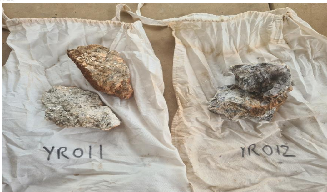
Figure 6. Muscovite and Grey Lepidolite up to 15% by volume in Pegmatite Samples

Rock chips contained varying amounts of lithium mica; primarily lepidolite and possible zinnwaldite (Figure 5). The absence of spodumene in the dykes has been confirmed by assay and downgrades these targets.