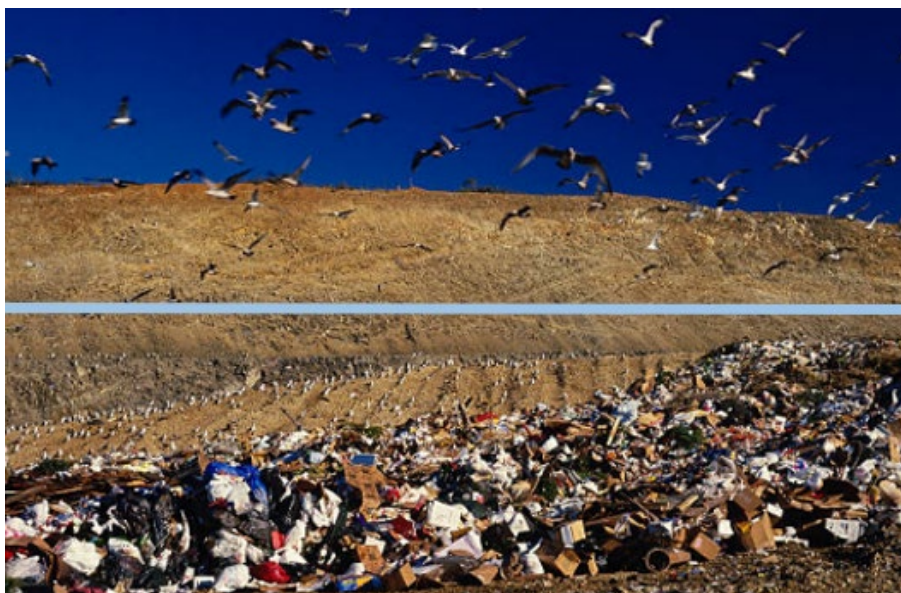
The blue highlighted line indicates where an active manufactured zeolite layer could function to intercept and destroy methane emitted from the underlying refuse

Methane is the second most significant GHG with a 100-year global warming potential 28 times greater than CO 2 and landfill methane releases just under 1 Gt of atmospheric CO 2 -e per annum.