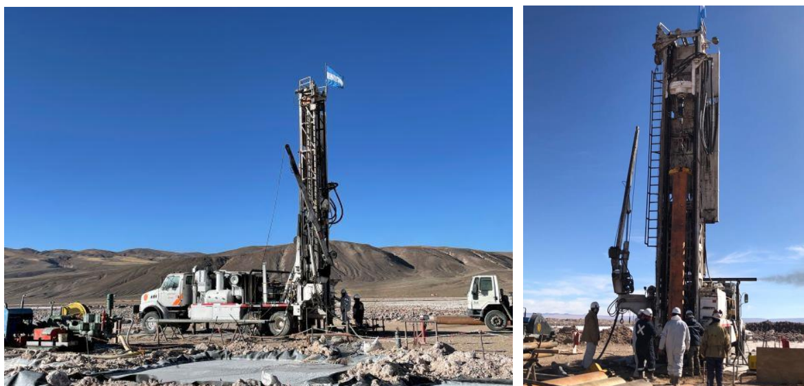
Figures 5-6. Rincon Lithium Project – 2,000tpa Operation Site Works in Progress

1 An Exploration Target is not a Mineral Resource. The potential quantity and grade of an Exploration Target is conceptual in nature. A Mineral Resource has been identified above the Exploration Target, but there has been insufficient exploration to estimate any extension to the Mineral Resource and it is uncertain if further exploration will result in the estimation of an additional Mineral Resource.