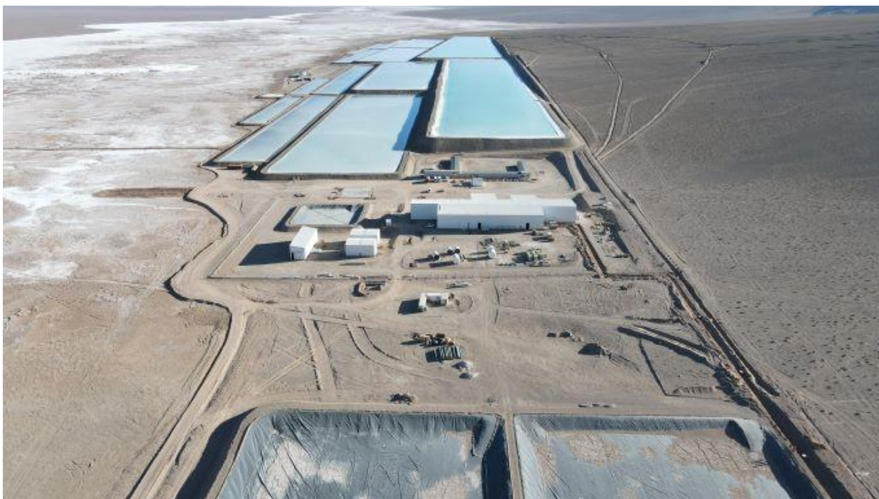
Figure 1. Rincon Lithium Project – 2,000tpa Operation Site Works in Progress

The construction phase comprises the process plant, equipment and associated installations, earthworks and site facilities (including additional camp development and associated site infrastructure), and expansion of the brine system (pumping station, plant settling ponds), with;