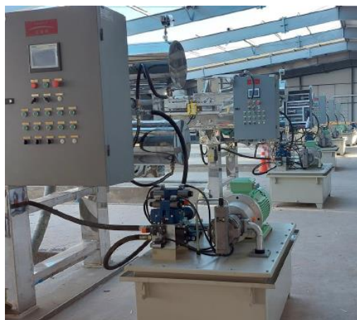
Figures 3-4. Rincon Lithium Project – 2,000tpa Operation Site Works in Progress