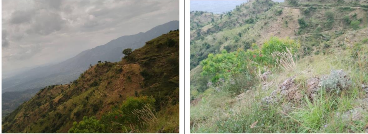
Figure 2 – Example of previously identified outcrops for planned rock/channel sampling at the Ketele LCT Project.

This initial program will comprise sampling of prospective geological units (granites, pegmatites, etc) and regional structures which have been previously identified and mapped in this underexplored area of Ethiopia (Figure 2). This sampling will include rock grabs and channel samples, the latter yielding continuous samples across an entire outcrop. All samples collected by HTM will be submitted to a European laboratory with results expected in February 2024.