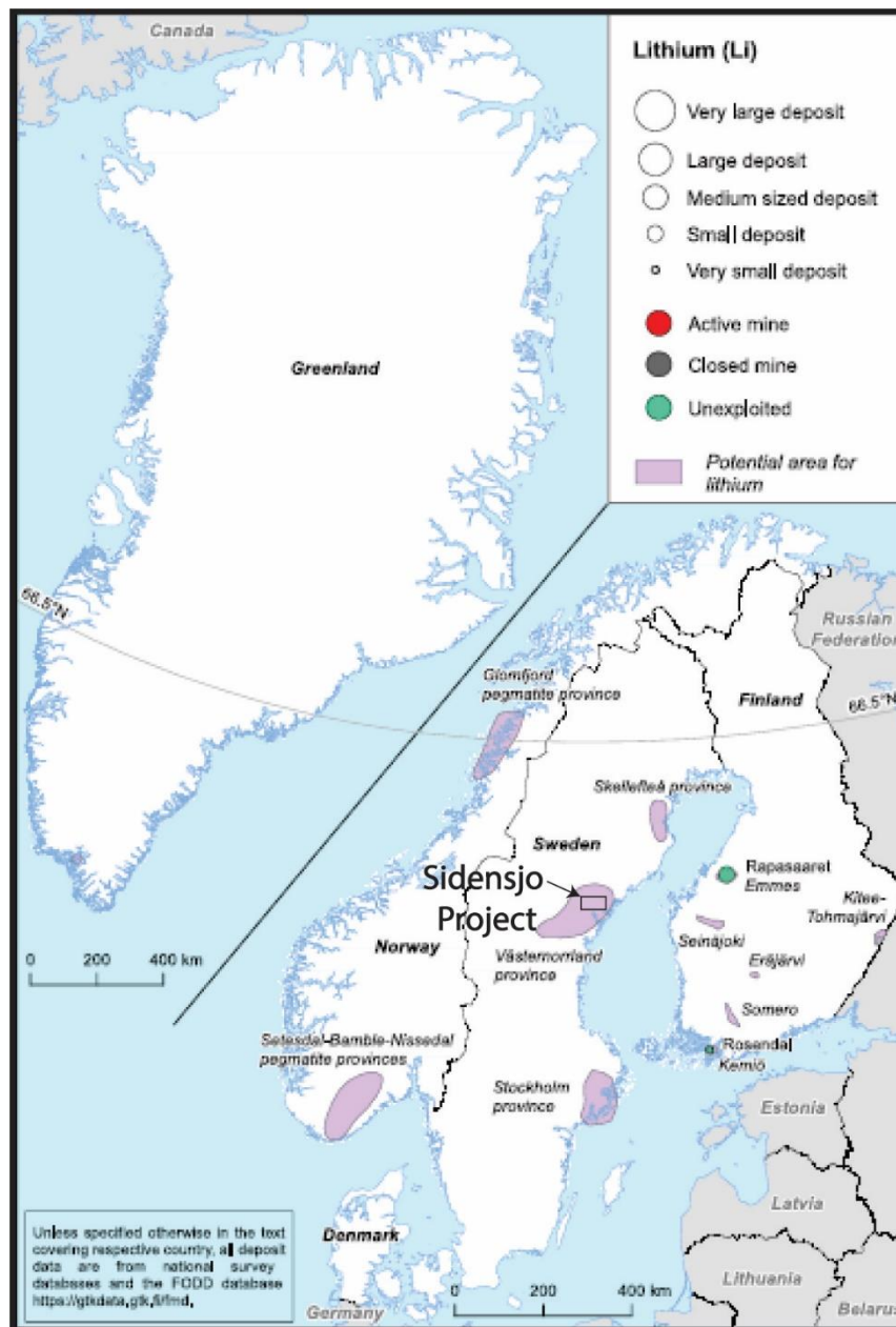
Figure 2. Location of Sidensjö project and the presently known most important lithium deposits in the Nordic countries, showing size and status classifications and associated prospective areas for lithium (in pink).

AUTHORISED FOR RELEASE ON THE ASX BY THE COMPANY'S BOARD OF DIRECTORS