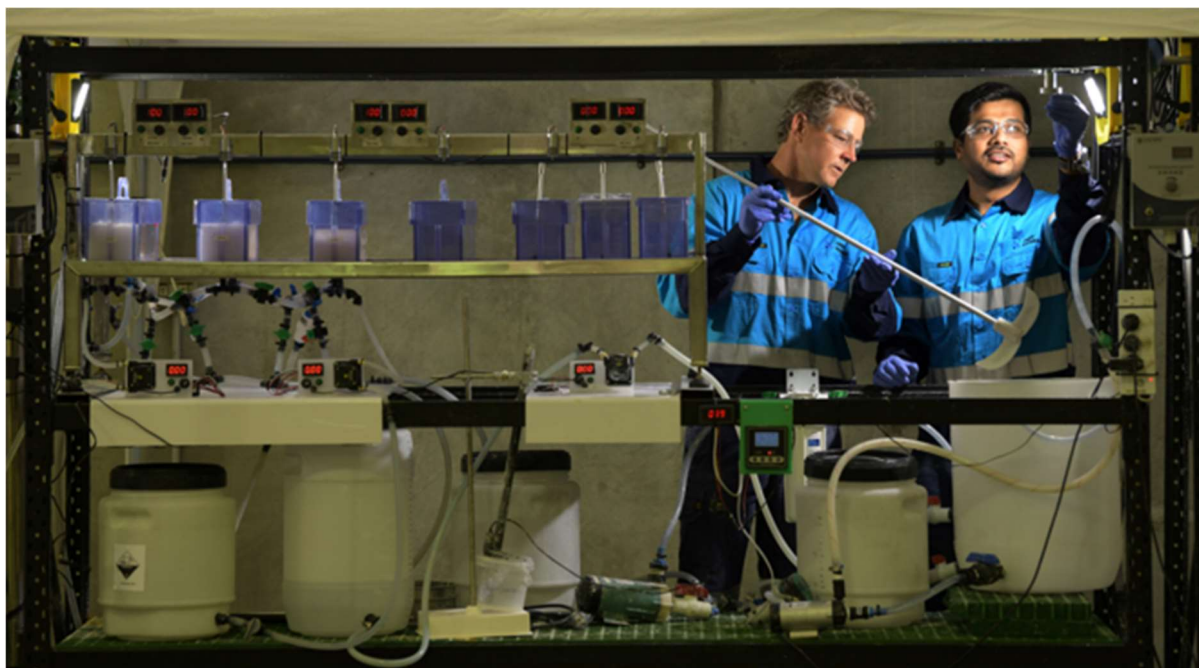
Figure 1 – Optimisation of a small module of the HiPurA® Micro Plant