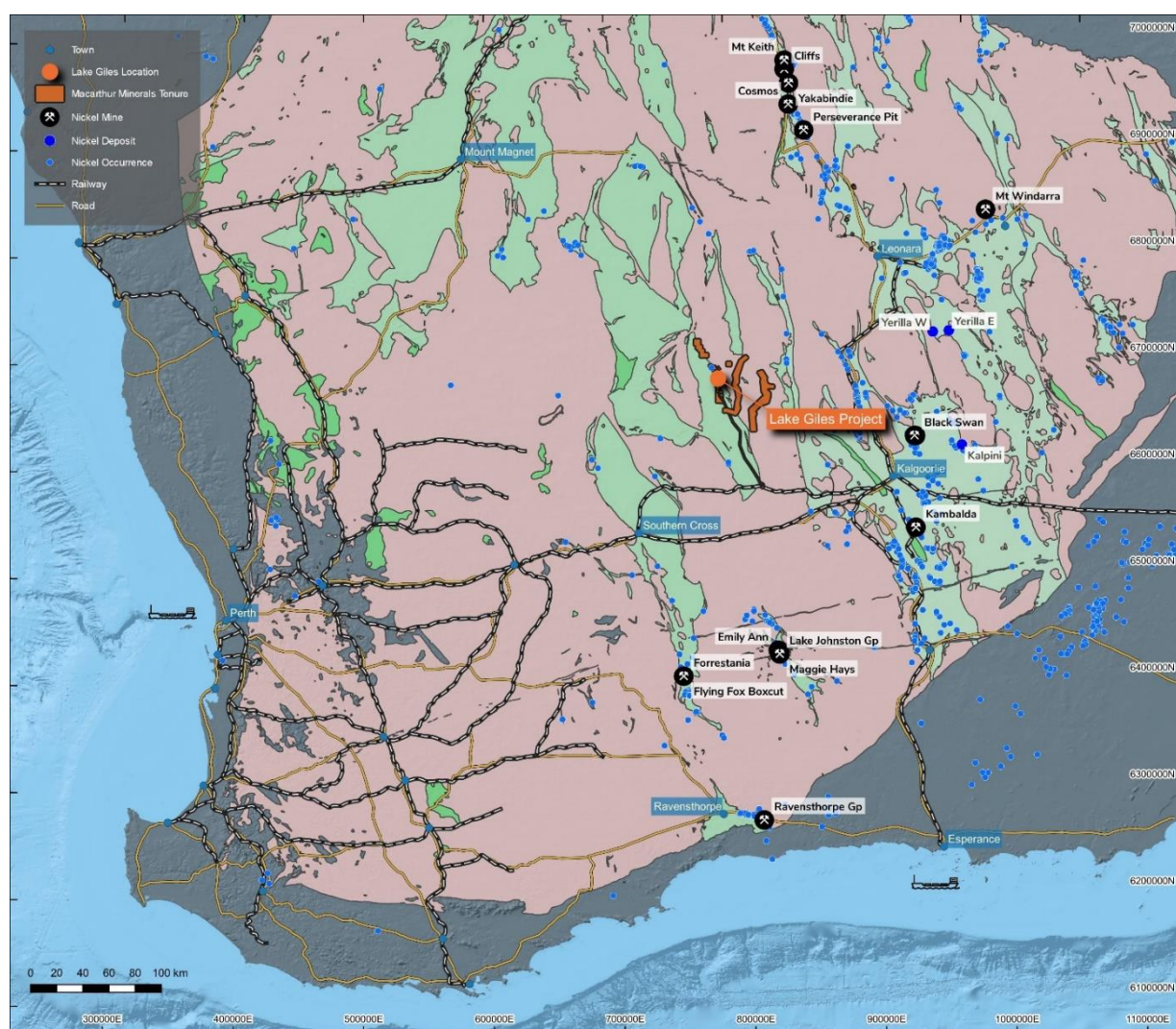
Figure 2: Lake Giles Project Location

The Project is owned by Macarthur Iron Ore Pty Ltd, a 100% owned subsidiary of Macarthur Minerals Limited ("Macarthur" or "the Company").