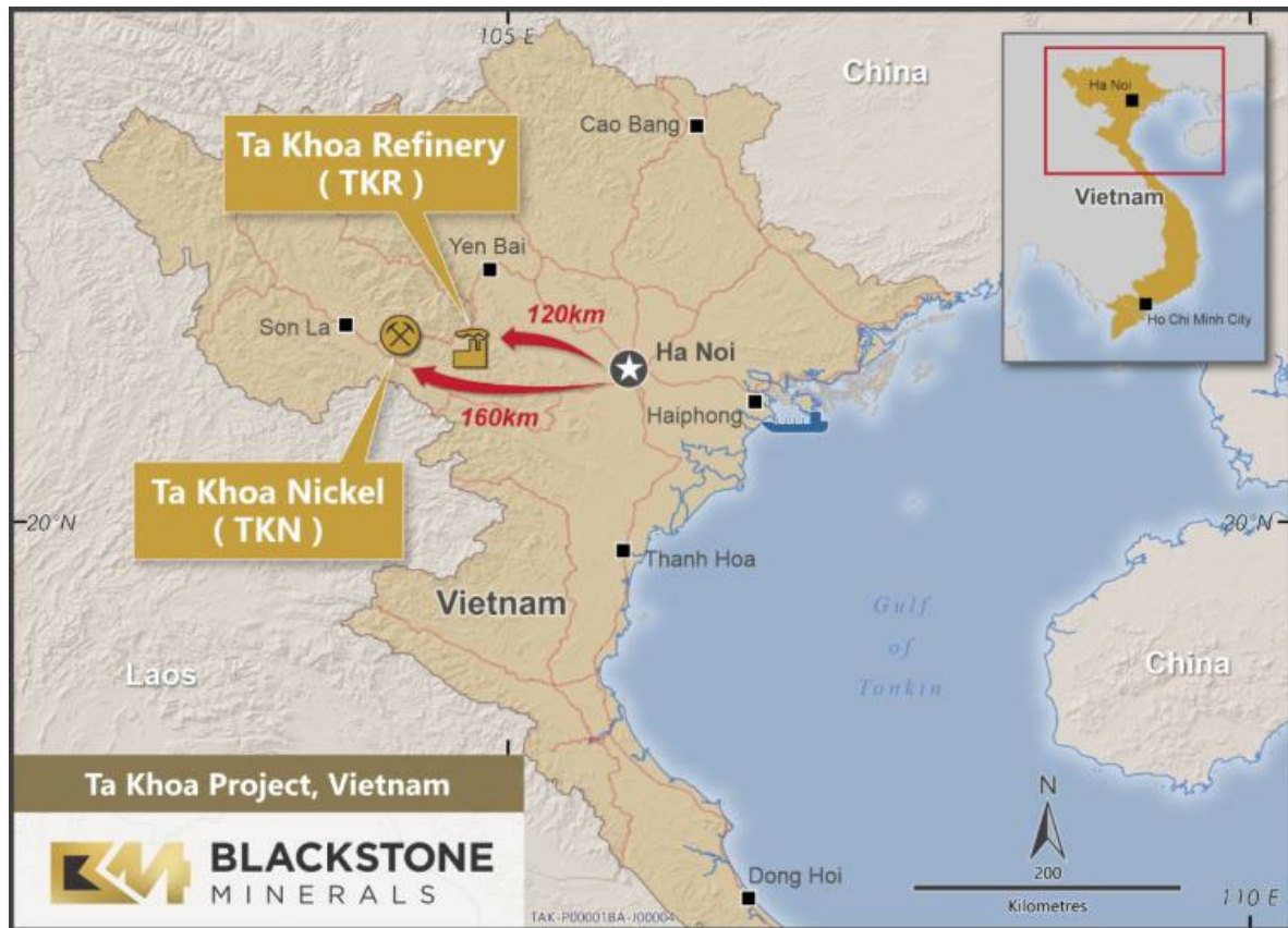
Figure 2: Ta Khoa Project Location

The Company's development strategy is underpinned by the ability to secure nickel concentrate and Ta Khoa is emerging as a nickel sulphide district with several exploration targets yet to be tested.