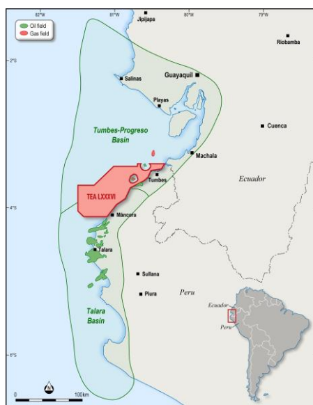
Figure 1 – Tumbes Basin TEA area in northern Peru.

The 4,858km 2 TEA is located in the gulf of Guayaquil in water depths that range from 100m to 1,500m, across the Tumbes-Progreso and Talara basins (Figure 1).