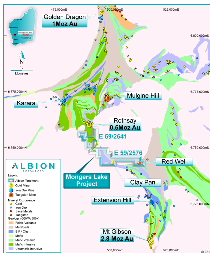
Figure 3: Mongers Lake Project Location Map on GSWA 500K Geology showing the location of the Red Well prospect area.

The ground FLEM survey is currently underway and the results are expected in the coming weeks and any new anomalies will be reported shortly thereafter.