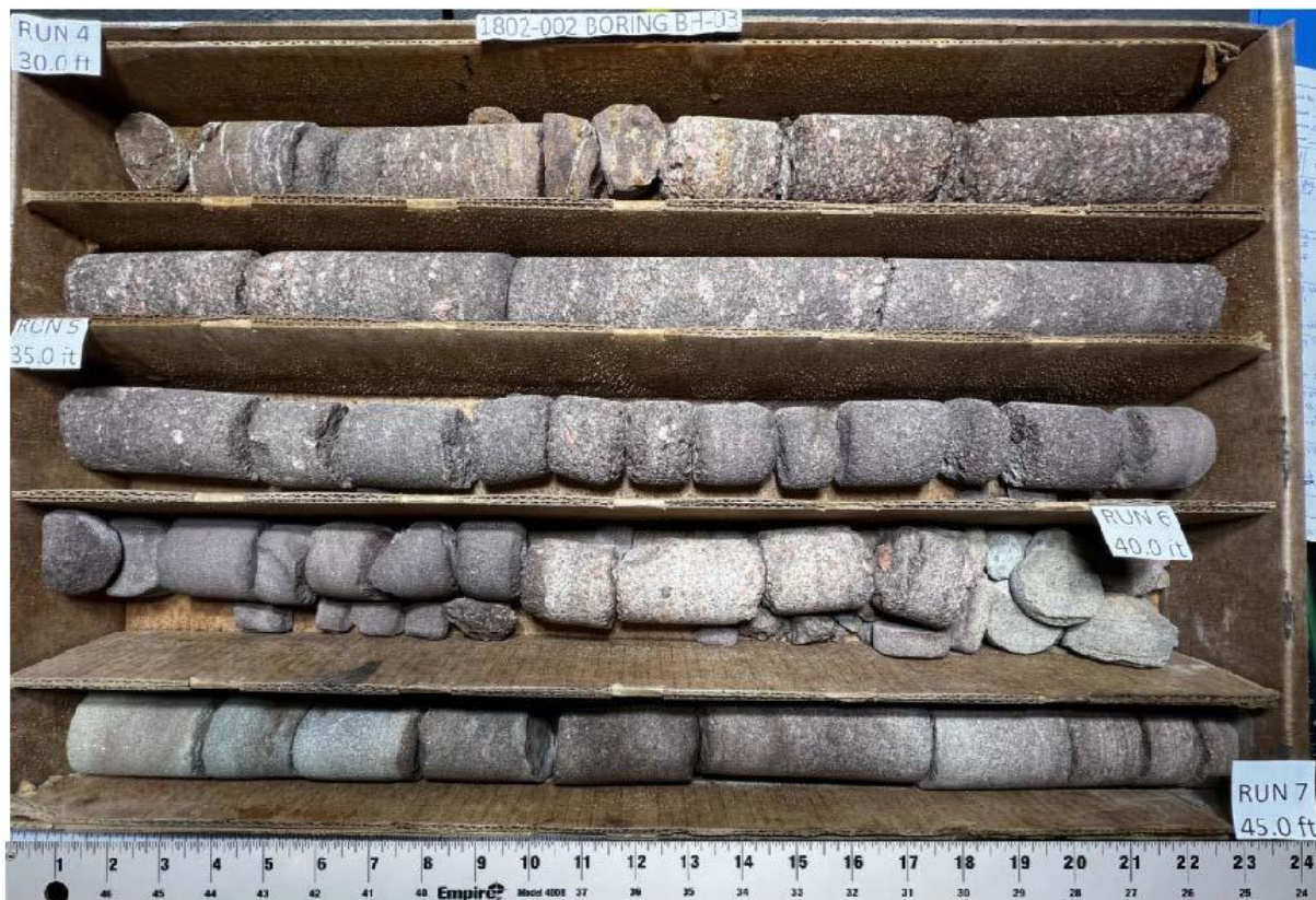
Figure 2: The core from Borehole 3 (B-3)