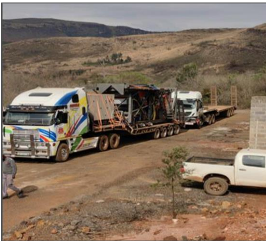
Figure 9: DMS Arriving on-site at Frankfort.