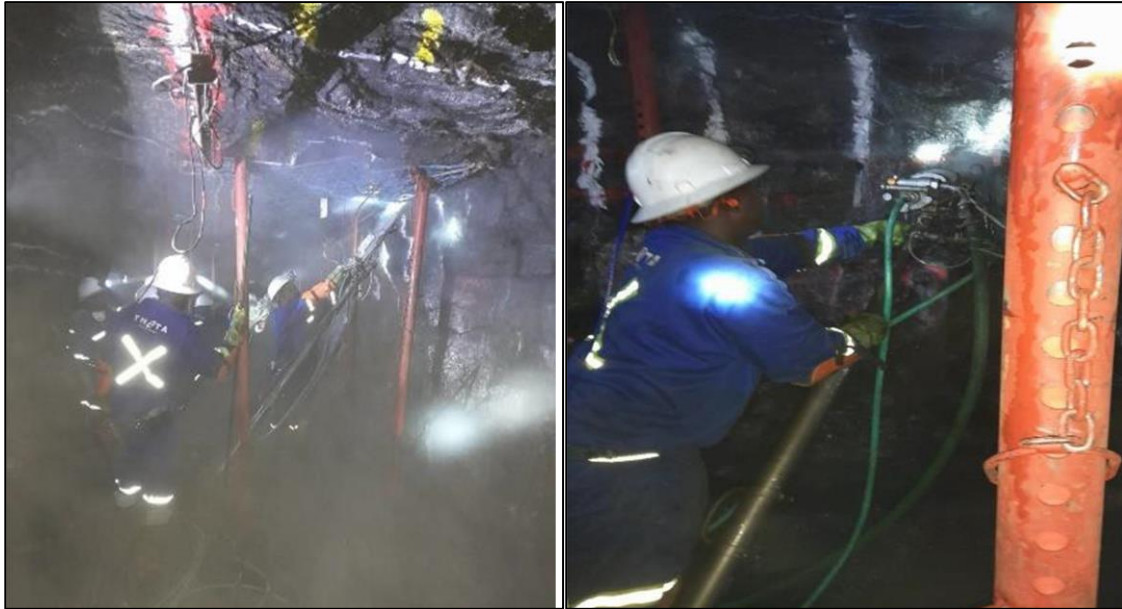
Figures 7 and 8 Show Drilling and Blasting Preparation at Frankfort Mine

From the surface tipping point, the blasted ore (run-of-mine) was loaded into a dump truck and transported to the DMS area, where the ore was crushed and screened. The product was then put through the DMS to separate the gold-bearing material from the waste material. This is done based on the difference in the densities of the waste material and the gold-bearing material.