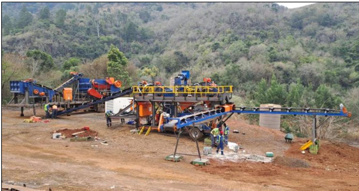
Figure 12: Construction and commissioning of DMS.