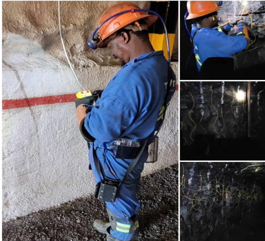
Figure 6: Drill and blast activity underway at Frankfort Gold Mine