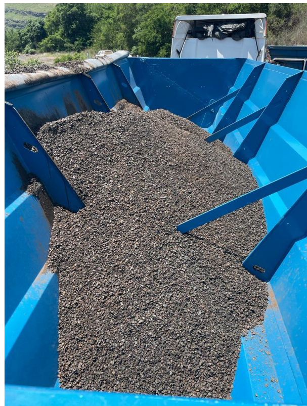
Figures 2 to 5: Pictures of Ore loading and transporting.