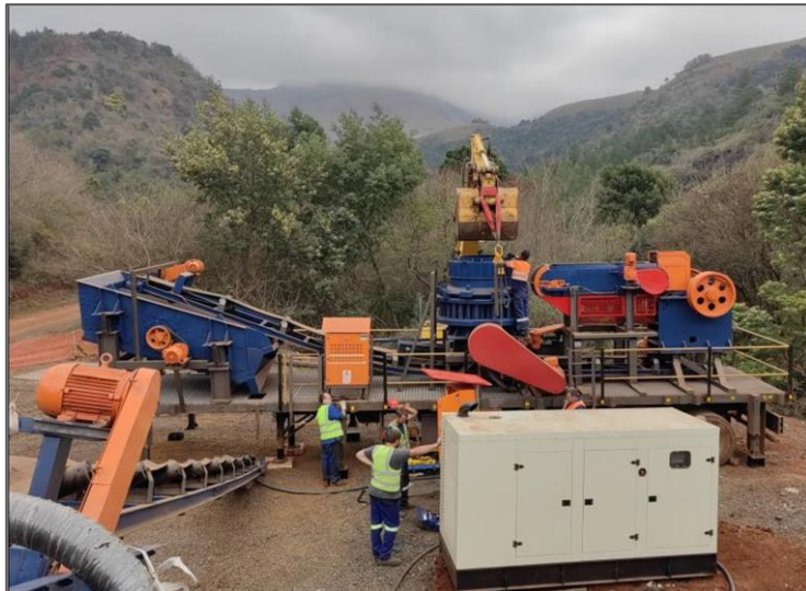
Figure 11: Crusher offloaded into position.