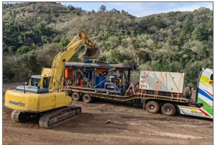
Figure 10: DMS being offloaded on site.