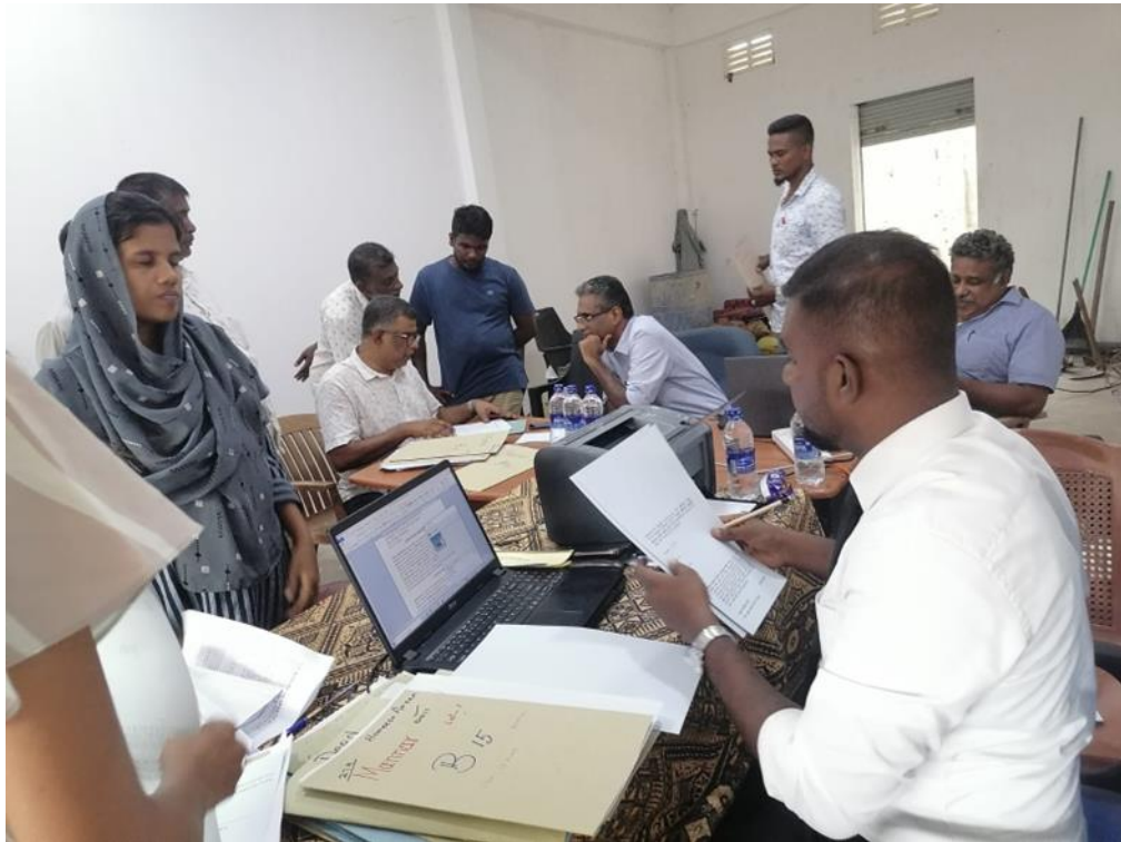
Figure 1: Process of signing Land Access Agreements at Mannar.