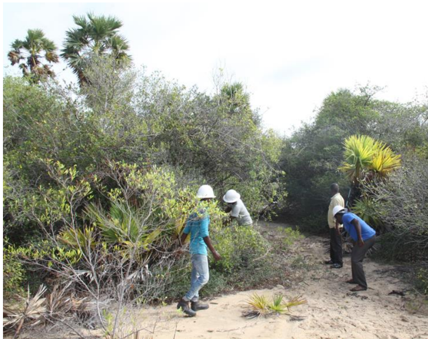
Figure 4: Identifying locations for environmental clearance review.