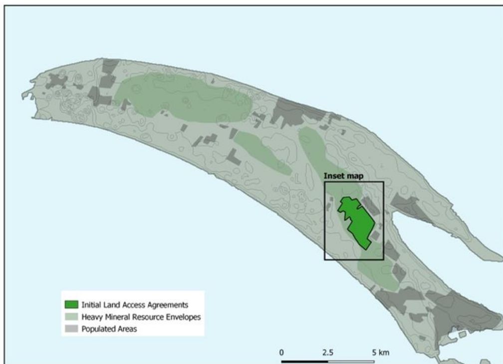
Figure 2: Priority zone 1 Land Access Agreement area at Mannar Island.