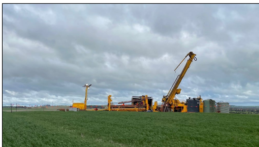
Photo 1. The drill rig on-site about to commence drilling.