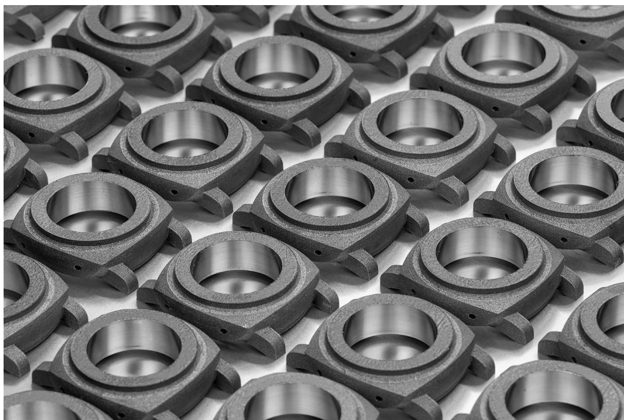
Panerai watch cases 3D printed using IperionX's low carbon, 100% recycled titanium powders.

We plan to re-shore titanium metal production in the United States by vertically integrating the Technologies and the Titan Project to make sustainable, lower cost titanium.