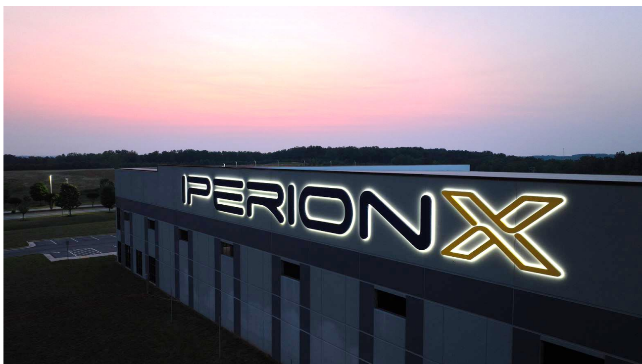
IperionX titanium metal production facilities at the Southern Virginia Technology Park in Halifax County, Virginia.