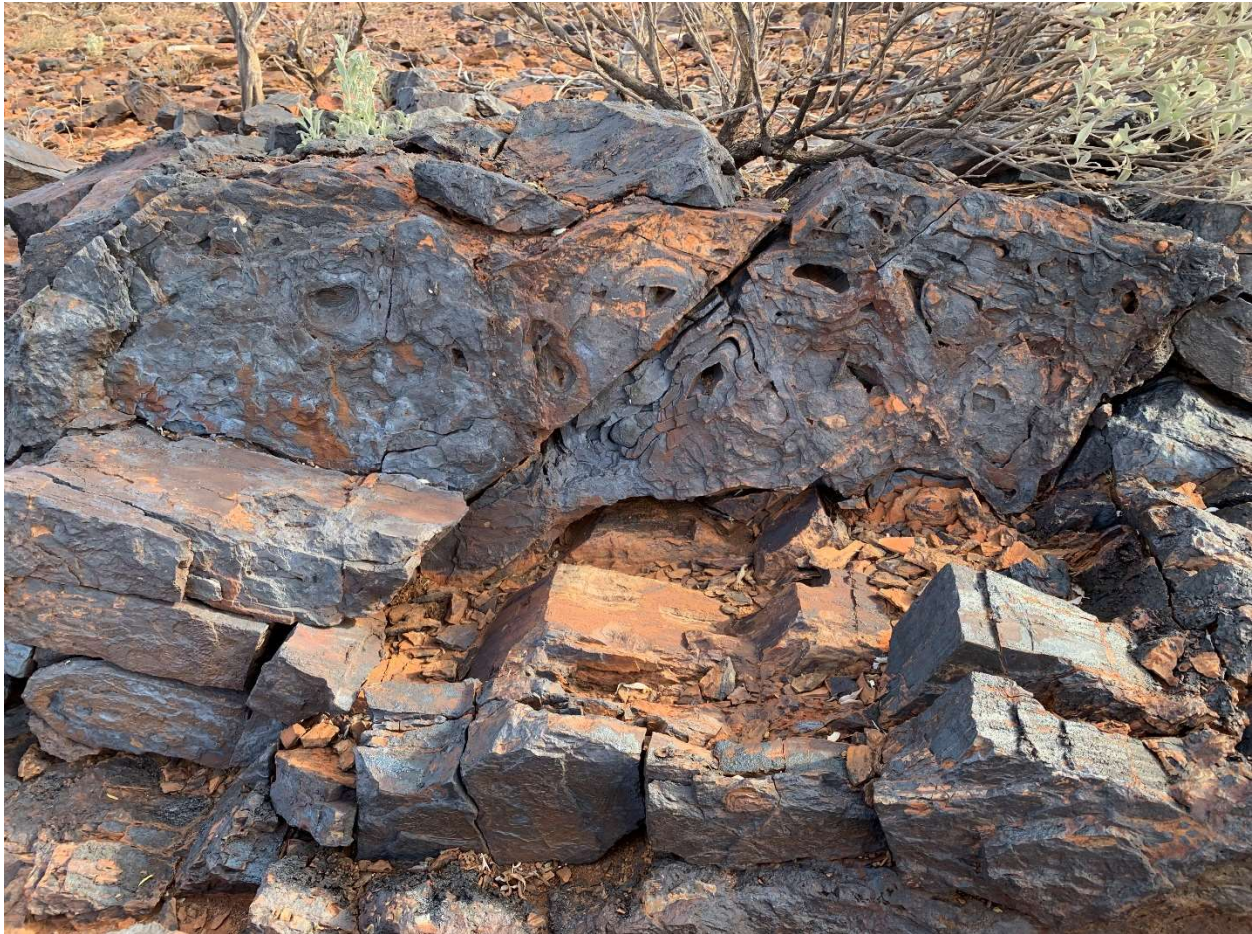
Figure 2: Manganese outcropping – Tenement E09/2543

Manganese is recognised as a critical mineral by the Office of the Chief Economist (Australian Government Department of Industry, Innovation and Science). Further, a White House document (June 2021) states that manganese use in battery cathodes may result in the metals preferred element emergence in next generation battery cells, due to its 'relative safety' and 'having by far the most stability'.