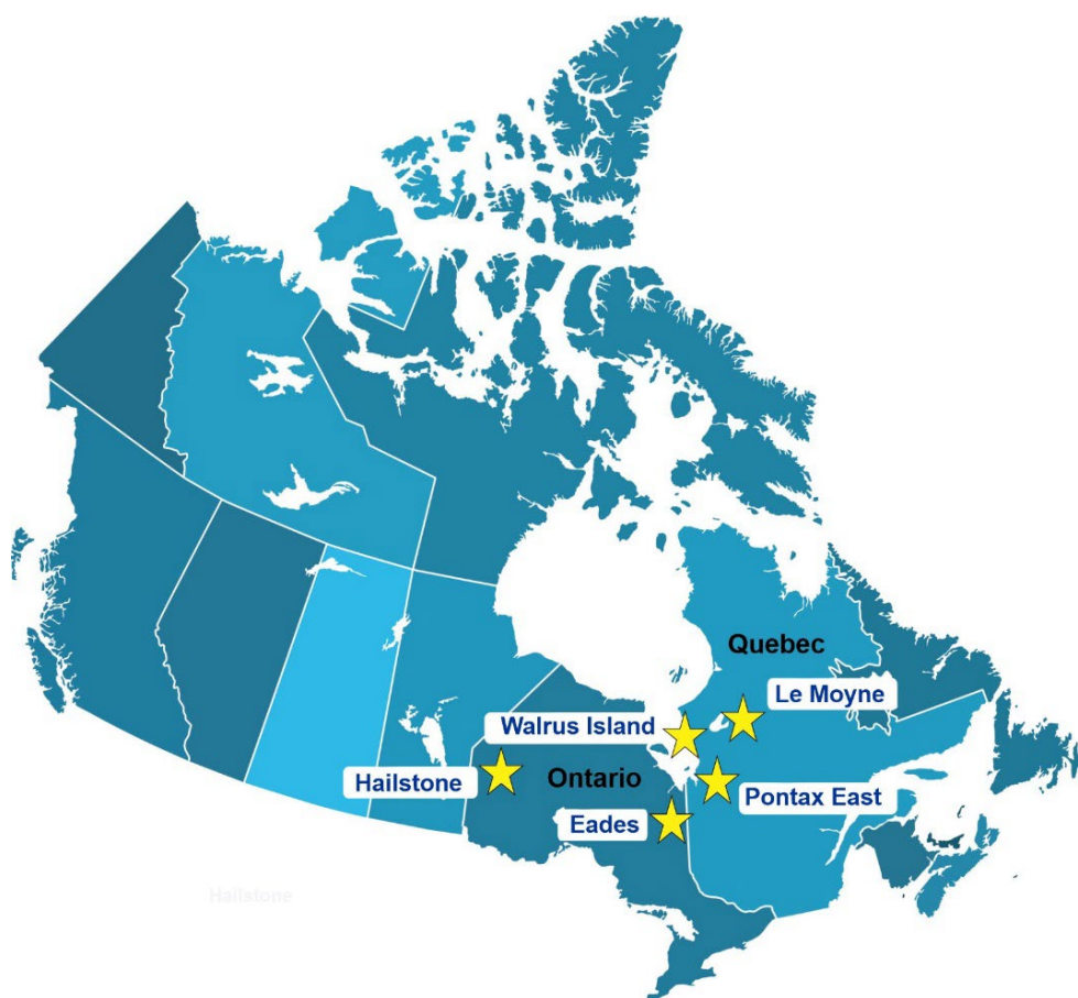
Figure 1: The locations of the new Narryer Li Projects in Ontario and (James Bay) Quebec, Canada