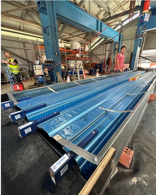
Image 1. Slab System test preparation