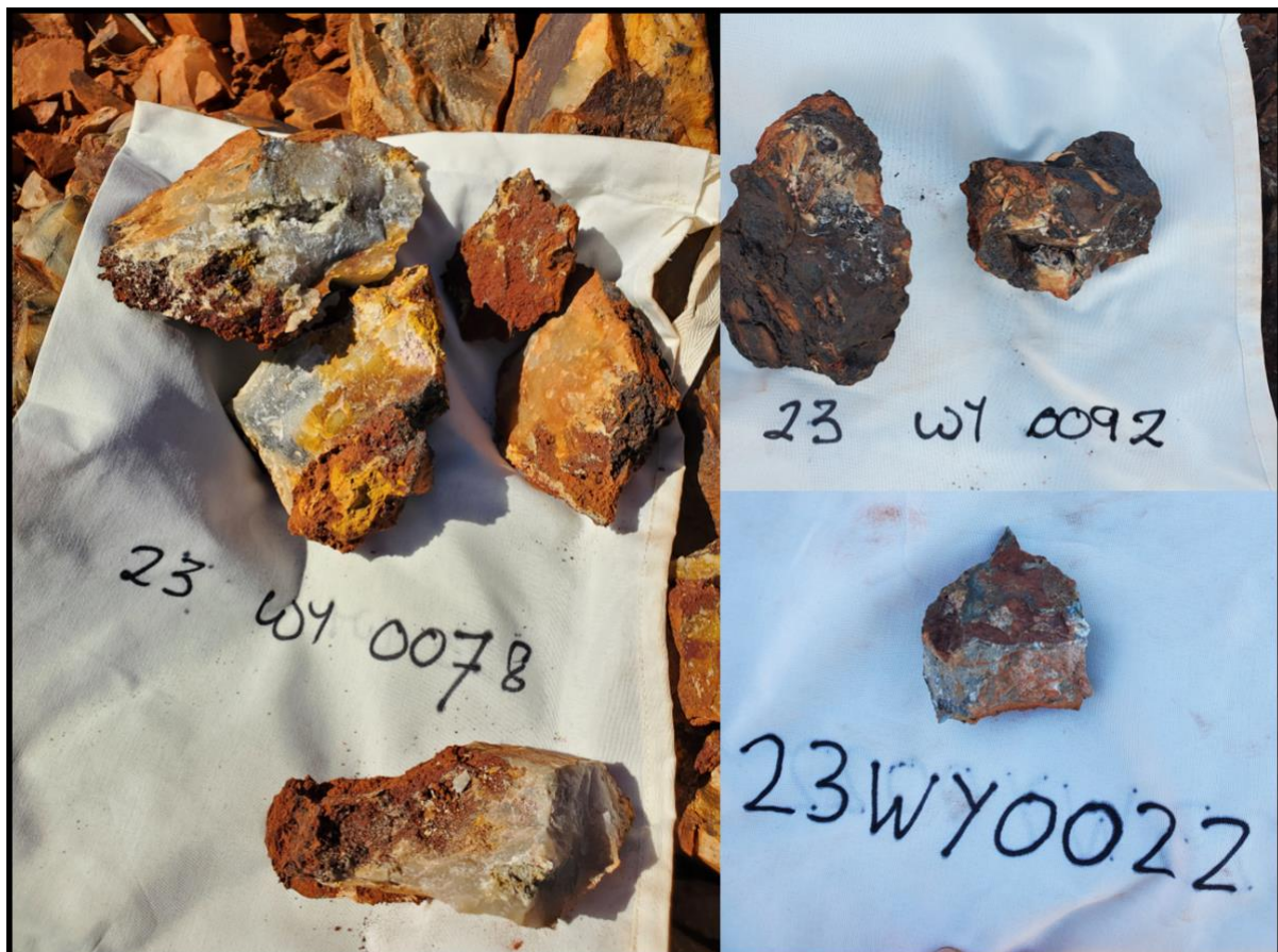
Figure 2: Images of prospective samples

While rock chip assays are outstanding (~4-6 weeks), the early observations have given the Company the confidence to plan further work which will include a 4,390 line-km, high-resolution aerial magnetic survey (Figure 3) and further, detailed mapping and sampling with a focus on the Mt Edith and Yandi Well targets.