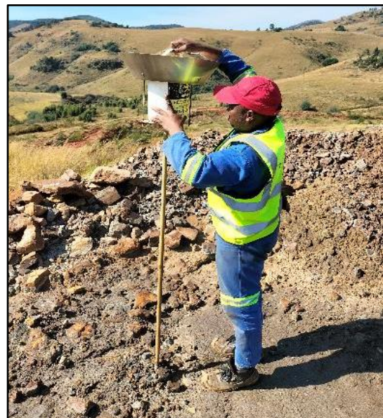
Figure 2: Dust Monitoring March 2023