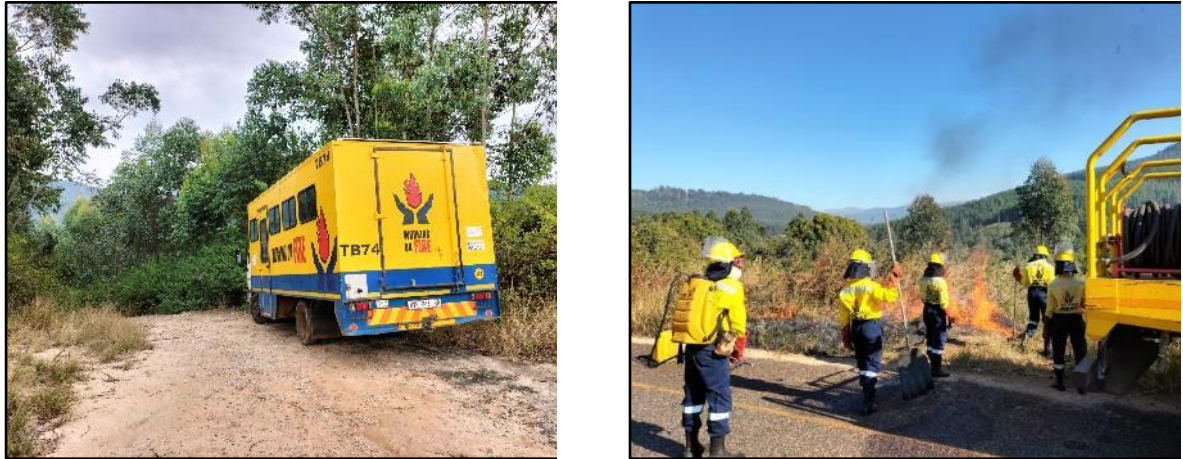
Figure 3: Implementation of the firebreaks at Rietfontein

Working On Fire (Pty) Ltd has been appointed to assist with the implementation of the firebreaks at Rietfontein.