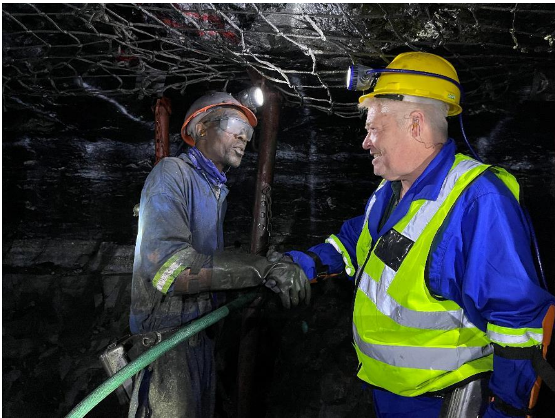
Figure 1: The Chairman thanking a miner at Frankfort Gold Mine on the day of the first blast (July 2023)

The A$5 million (US$3.3 million) funding package was to finance the bulk trial sampling program. The funding was raised with strategic long-term investors via three separate unsecured Convertible Loan Agreements ( 'Agreements' ) to fund the bulk trial sampling program at the Frankfort Mine along with working capital for the Company.