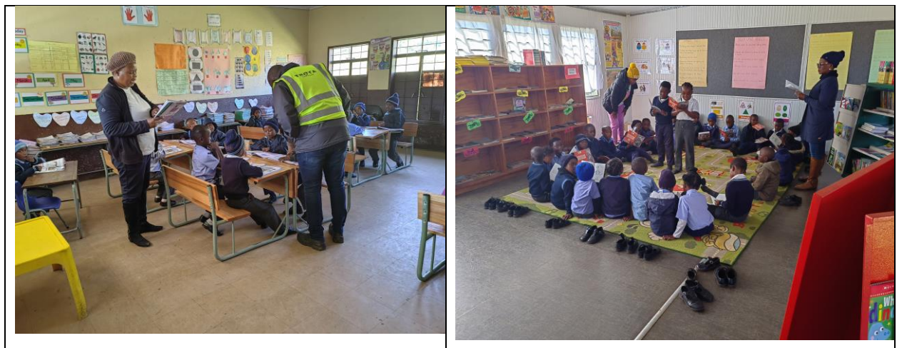
Figure 5: Pilgrim's Rest Primary School

Both schools are grateful for the support they receive from the Company. Regular visits to the schools are conducted to have a glimpse at the progress that the schools are making.