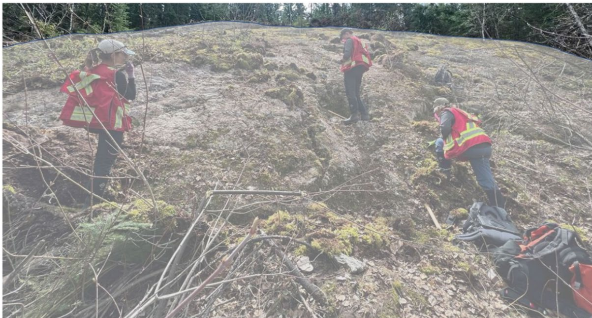
Figure 2 – Field team sampling the Gullwing Lake Pegmatite (significant outcrop identified in grey shading)

Field teams conducted mapping and sampling, along with identification of targets for drilling. The Gullwing and Tot prospects add immediate growth potential to the Mavis Lake Project. Results from the fieldwork were released subsequent to the Quarter end 4 , the results confirmed high-grade lithium mineralisation in spodumene, up to 3.2% Li 2 O from rock chip samples, permitting and planning for drill testing is ongoing.