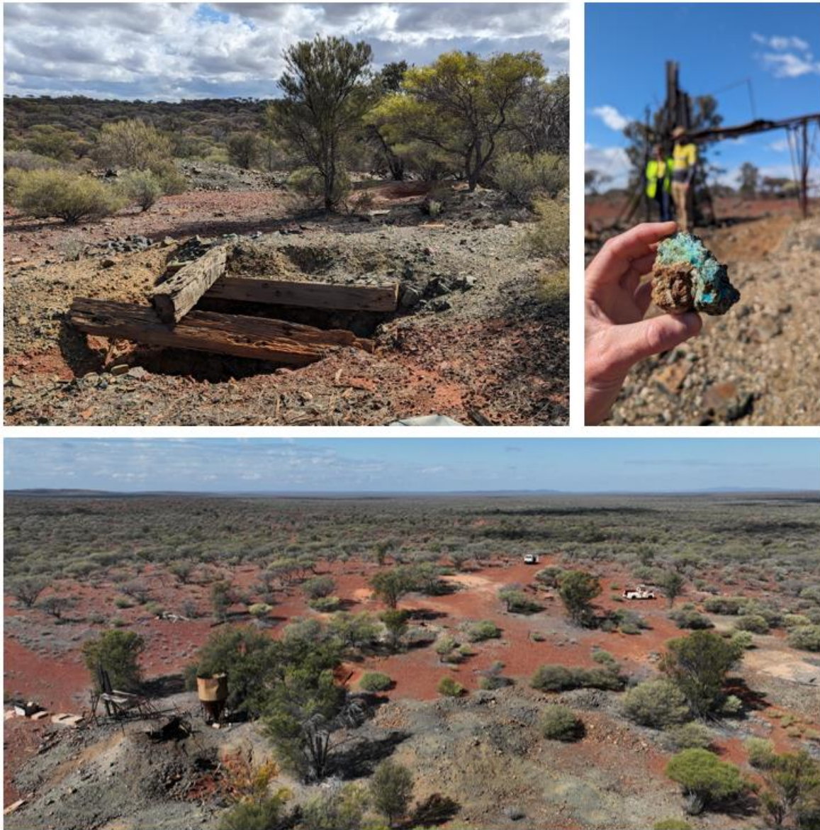
Figure 3: Photos of the Warriedar Copper target area. Top left: old shaft. Top right: example of surface samples. Bottom: aerial drone photo looking north.