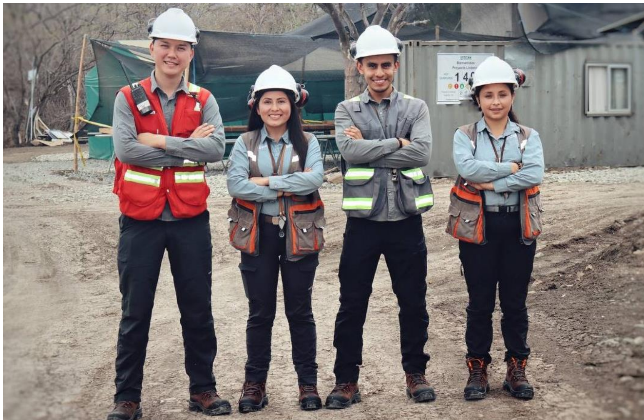
Titan Geologists, September 2023

"We look forward to a steady flow of results from Cerro Verde and Papayal drilling, as we continue to advance mapping and surface geochemical work programs across the broader project to identify new areas of mineralisation."